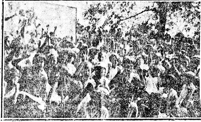
The opening of Victory Playground, where about 1,000 children are able to play and receive milk and other nourishing food, was acclaimed with joy by the strikers' children in Passaic. While parents picket the mills in their fight for better wages and working conditions, these children are building their minds and bodies for the struggles of the future.