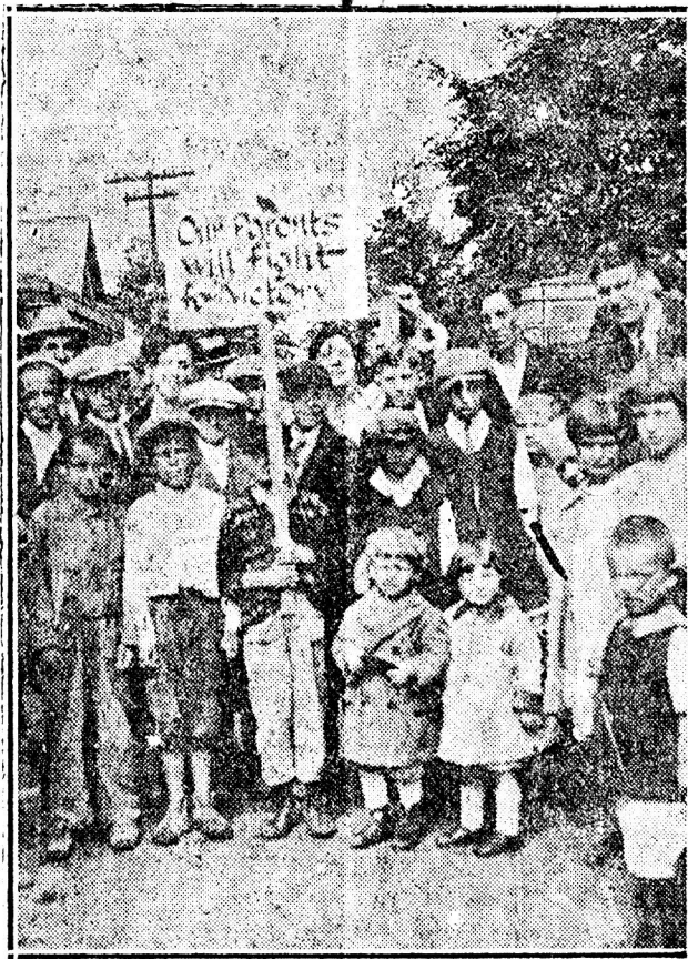
These strikers' children are about to board buses for Victory Playground.

the strike. The children assumed greater importance in the struggle, with the bosses trying to starve them on one hand and the workers, thru the general relief committee, doing their utmost to protect them from the bosses' starvation offensive.