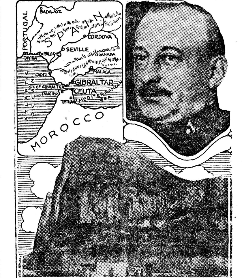
With the war in the Riff over and imperialism triumphant in northern Africa new complications are arising with regard to the strategic entrance to the Mediterranean. Primo de Rivera, Spanish dictator, shown above the Rock of Gibraltar, owned by Great Britain, has for years advocated that Spain recover the great fortress. France, on the other hand, has been anxious to acquire Ceuta, the stronghold on the African shore, which belongs to Spain. The map shows the relative positions of the two strongholds.