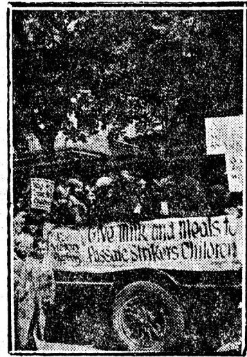
The Passaic mill barons sought to break the strike by cutting off relief to these children. Every worker should see to it that these strike children get a constant supply of milk and nourishing food.