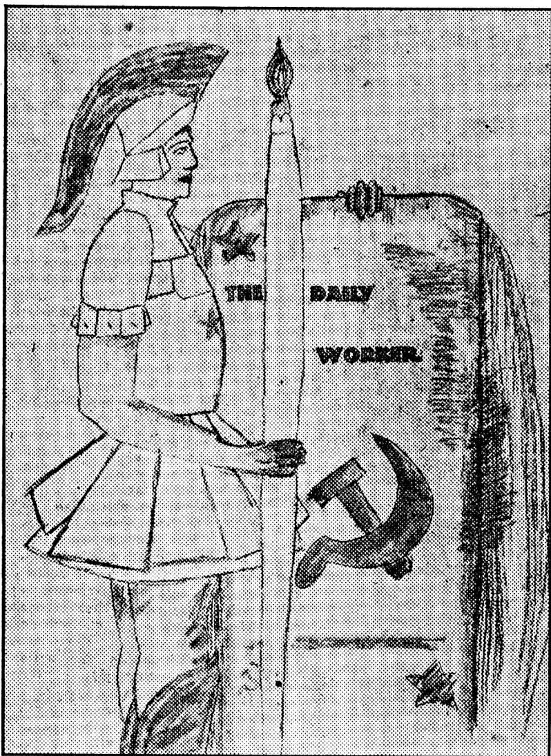
By Abe Stolar, Student Correspondent.