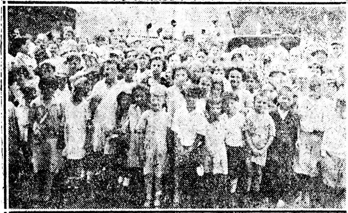
Competent leaders organize the games at Victory Playground so that the undernourished and run-down bodies of the Passaic textile strikers' children can be strengthened. The General Strike Relief Committee needs Labor's aid to supply these children with milk and nutritious food.

strike relief, the general relief committee of textile strikers, with offices at 743 Main avenue, Passaic, has been able to supply relief to thousands of strikers' families and give milk and meals to the strikers' children most of whom are suffering from malnutrition.