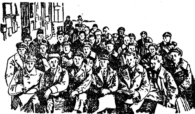
A Leningrad group of worker correspondents of the newspaper Nasha Gazeta (Our Newspaper). A detailed report on the Soviet All-Union Worker Correspondents' conference recently held in Moscow appears in the fourth number of the American Worker Correspondent, just off the press.

to the American Worker Correspondent (50 cents a year) to learn what and how to write.