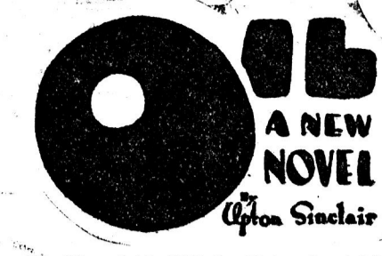
(Copyright, 1926, by Upton Sinclair)