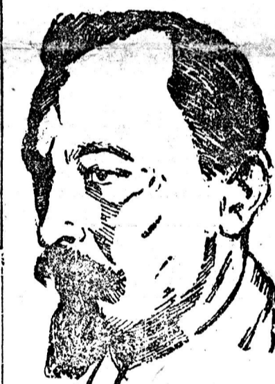
One of the outstanding leaders of the revolution and among the most trusted and responsible workers in building the new regime, Comrade Dzerzhinsky's loss will be deeply mourned by the workers and peasants of Russia.