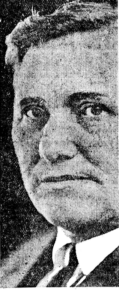
SMITH W. BROOKHART