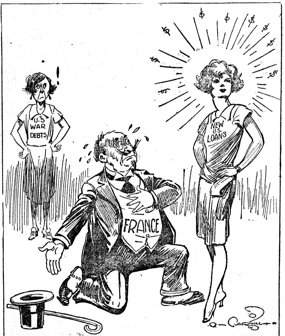
The Moth and the Flames.