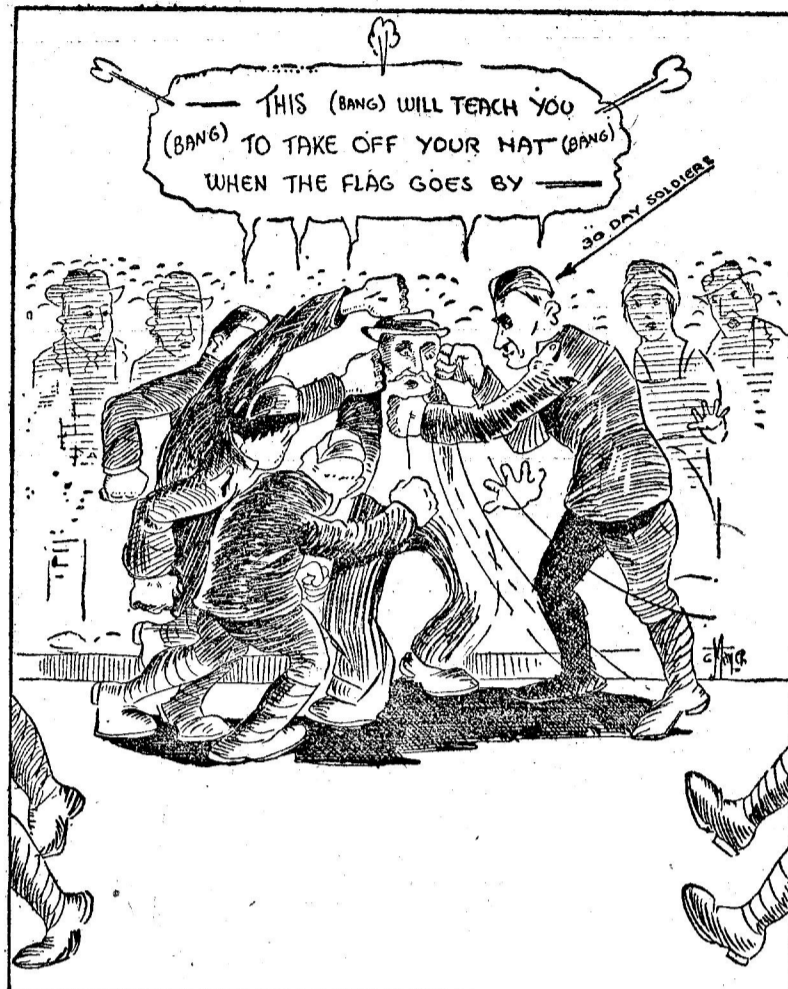
American Legion Lesson No. 1.