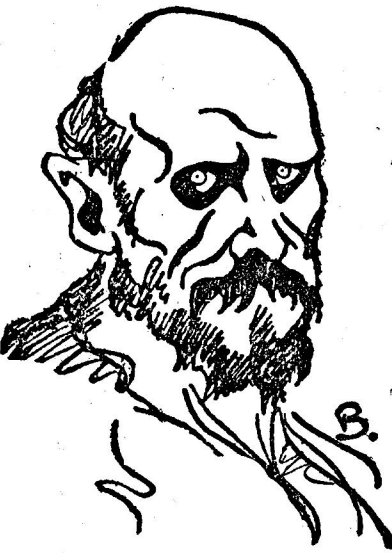
PREMIER ZANKOFF. Bulgaria's Bloody Butcher.

SOFIA, Bulgaria, Jan. 3.—It is believed that the rule of Zankoff, mass murderer of workers and peasants under white terror, and present premier of Bulgaria, is nearing an end. Internal struggles among the cabinet are breaking down his power. Yesterday Zankoff announced the resignation of the minister of public works, Stojentchev, and demanded an adjournment of parliament until the cabinet is reconstructed. The president of the chamber declared a majority vote for adjournment in spite of the clear majority against it. Violent protests were made by the opposition.