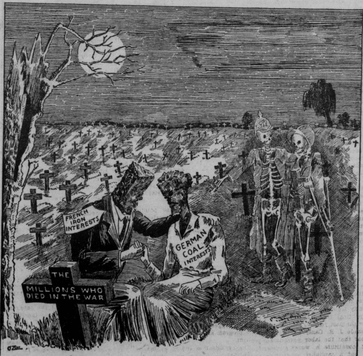
Big Business of the "Enemy Countries" Gets Together.