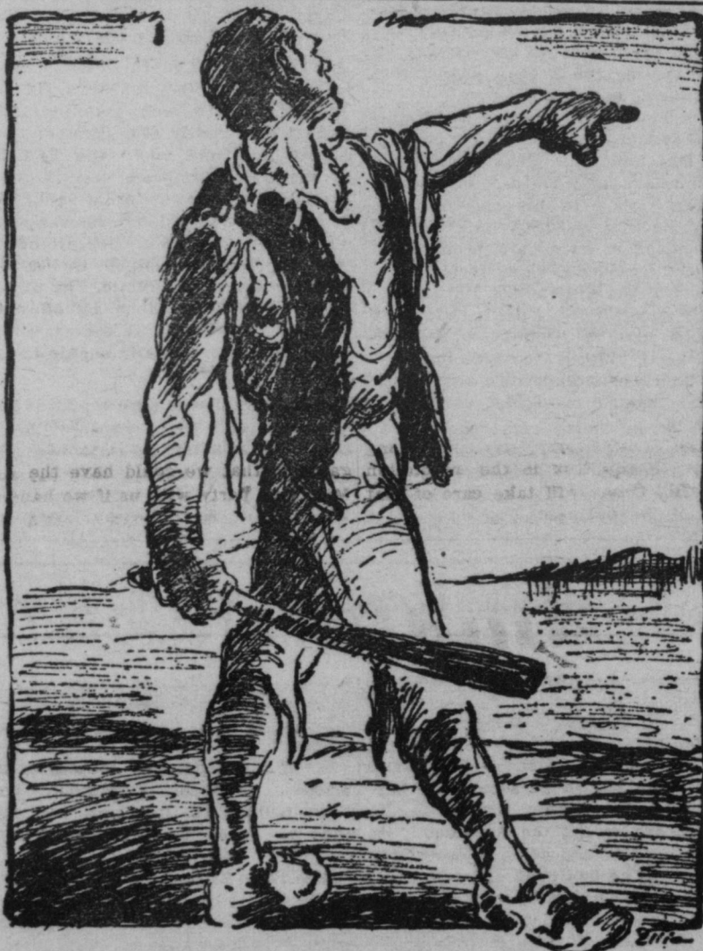
Ragged But Defiant