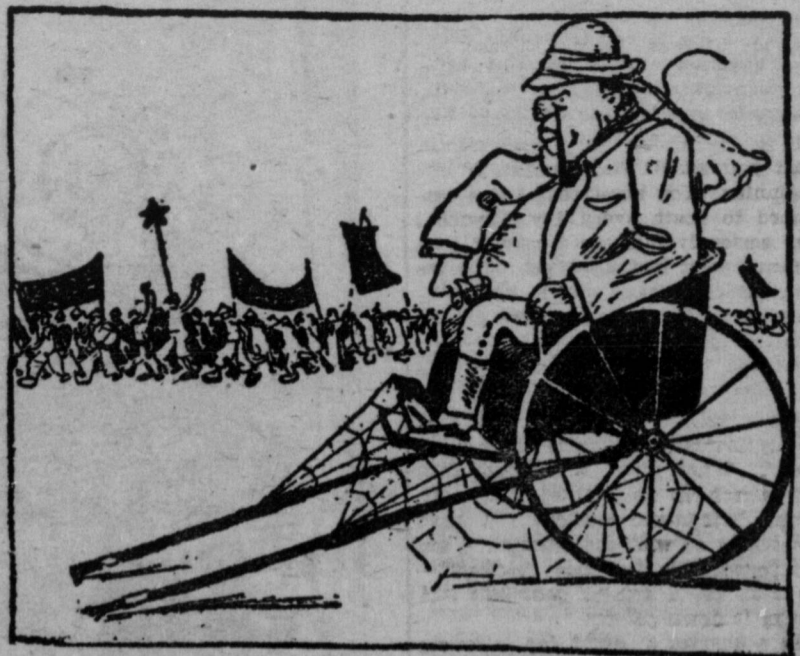
The rickshaws in China went on strike and the foreign gentleman can no more ride on their backs.