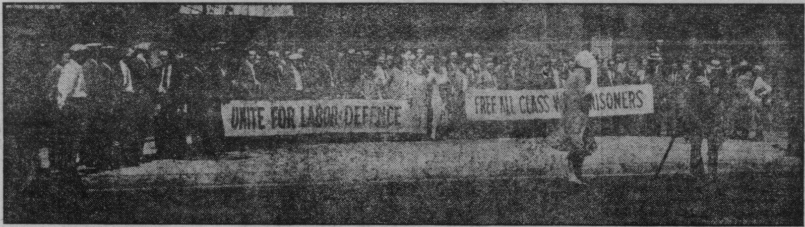
These workers attended the epoch-making gathering held in Chicago, June 28.

worker who does not wish to be shot by Japanese and English police; a Bolshevik is a Chinese student who stretches out a brotherly hand to the Chinese worker who is streaming with blood; a Bolshevik is a Chinese peasant who resents the fact that foreigners, whose arguments are deeds of violence, behave on this land as tho they were lord and master." The reactionary press of both hemispheres gives this excellent description of Bolshevism.