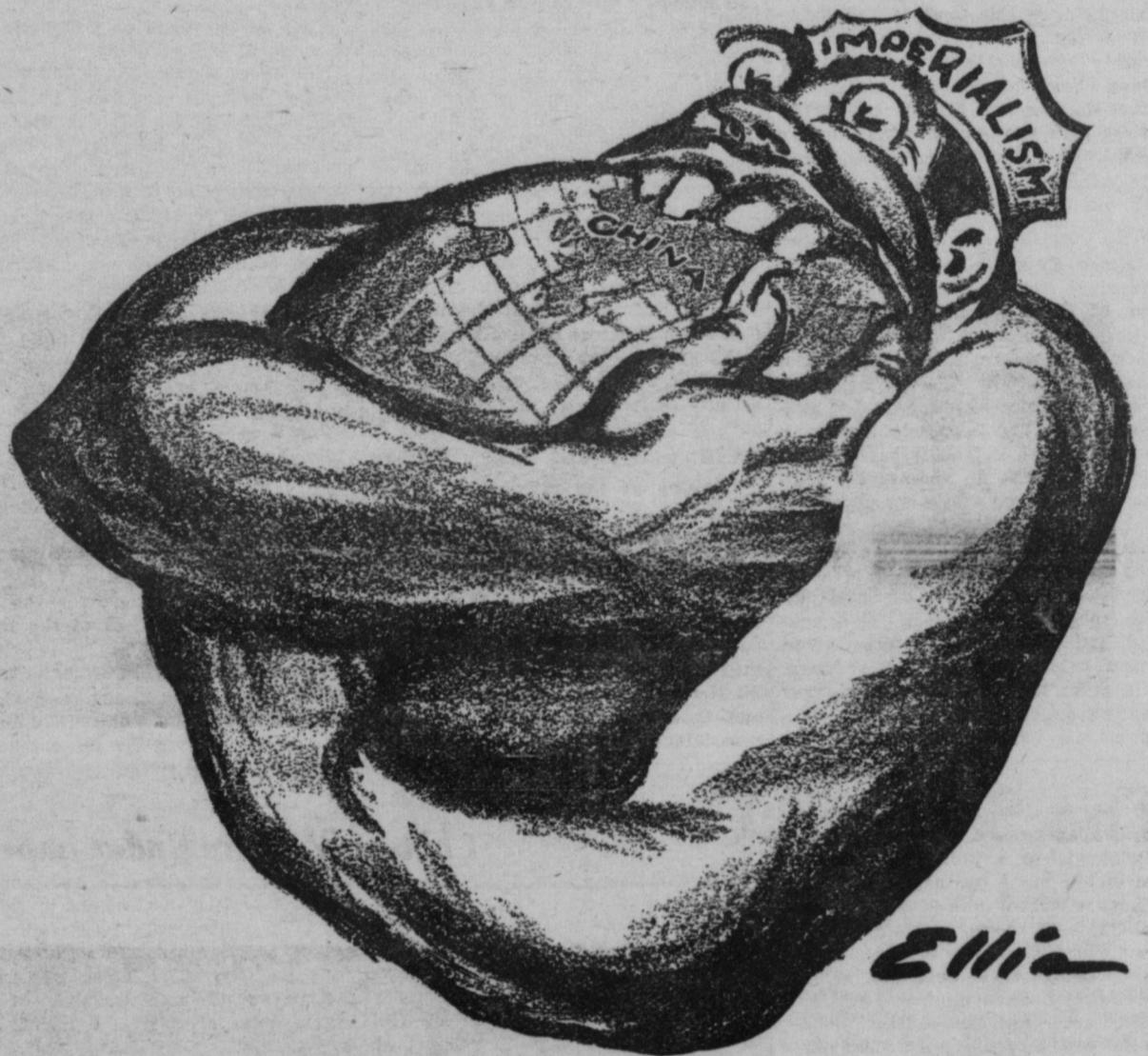
It's More Than He Can Chew.

1. The working class, thanks to its situation, cannot be infected with the "great power" ideas of imperialism, on the contrary, the entire situation compels it to take over the role of leader of the whole of the people against the foreign capitalists who are oppressing them.