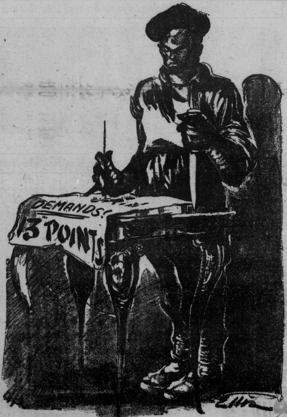
The Showdown in the Orient.