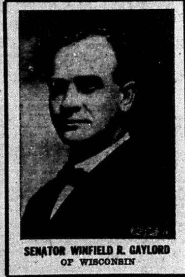
SENATOR WINFIELD R. GAYLORD OF WISCONSIN