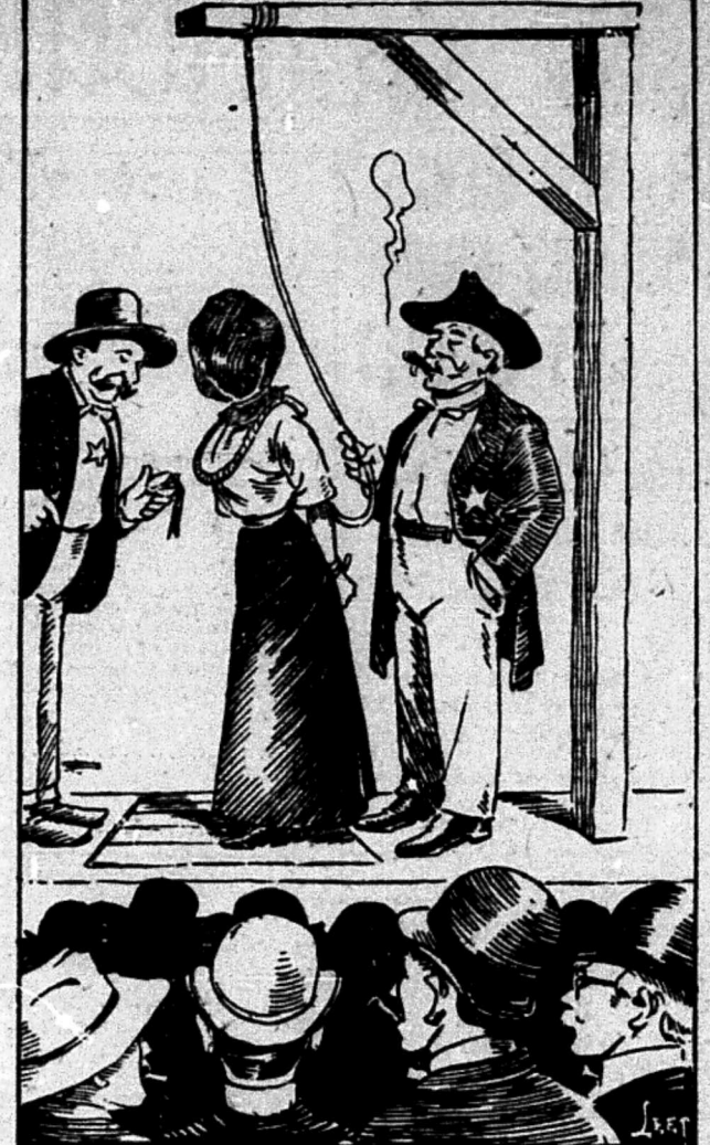
SHALL THE MOTHER WHO REVOLVED WITH ALL HER STRENGTH AGAINST A WHITE SLAVE LIFE SUFFER THIS DEATH?

The Socialist party is the only party that stands unequivocally for democracy in every department of life.