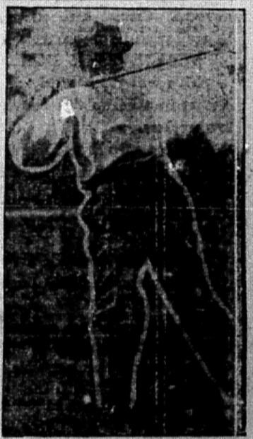
"Meet me face to face," Jackson, corner Clark, and