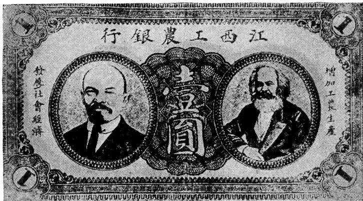
Chinese Soviet paper currency (one dollar), issued by the Kiangsi Workers' and Peasants' Bank. Printed on the bill are the slogans: "Increase the Industrial and Agricultural Production" and "Develop Social Economy."

The Provisional Central Government of the Soviet Republic of China, at its very foundation, also announced its "vigorous opposition to a new world war." The workers and peasants do not want war. However, imperialist powers, by bringing about war, by despoiling China and attacking the Chinese people, are forcing the Red Army of China and the Chinese masses to demonstrate again that the force of revolution is invincible.