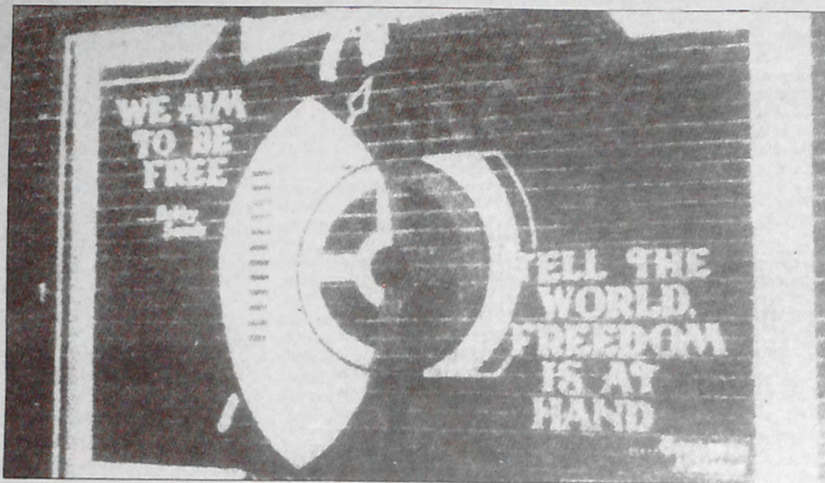
A Belfast wall mural makes the point more eloquently than a thousand British left excuses

Nationalists in the Six Counties, like non-whites in South Africa, have been systematically excluded from any say, decent housing, jobs, etc. In the late 60s, as in Sharpeville in South Africa, this brought about a social explosion as people took to the streets to demonstrate for basic rights. Like in South Africa, they were met with repression, beaten and shot off the