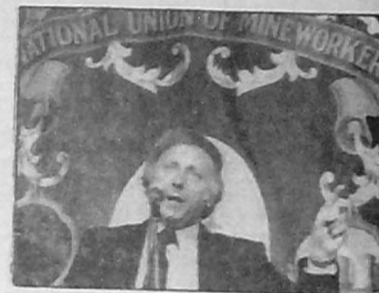
Scargill: a militant left reformist witch-hunted by Kinnock's rightwing cronies

As we go to press our monthly £600 fighting fund, in particular with the help of comrades AS, MJ and a new regular £10 per week pledge from comrade NC, stands at £440. A good position to again go over the top. There is good news too with our £2,000 desk top publishing appeal which we launched last month. On top of the £500 from comrade NB, we have had three other substantial donations, £300 from comrade LG, £220 from comrade JC and £200 from comrade SK, as well as a number of smaller donations. With a short term loan we are going ahead with the purchase, but we must raise the money to repay the loan as soon as possible.