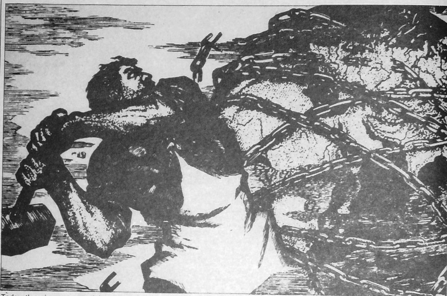
Today, there is greater need than ever for an International

The collapse of bureaucratic socialism and the liquidation 'official communist' parties have produced claims from some that proletarian internationalism is dead and from others a tentative call for a new international. But what is proletarian internationalism and what sort of an international do we need?