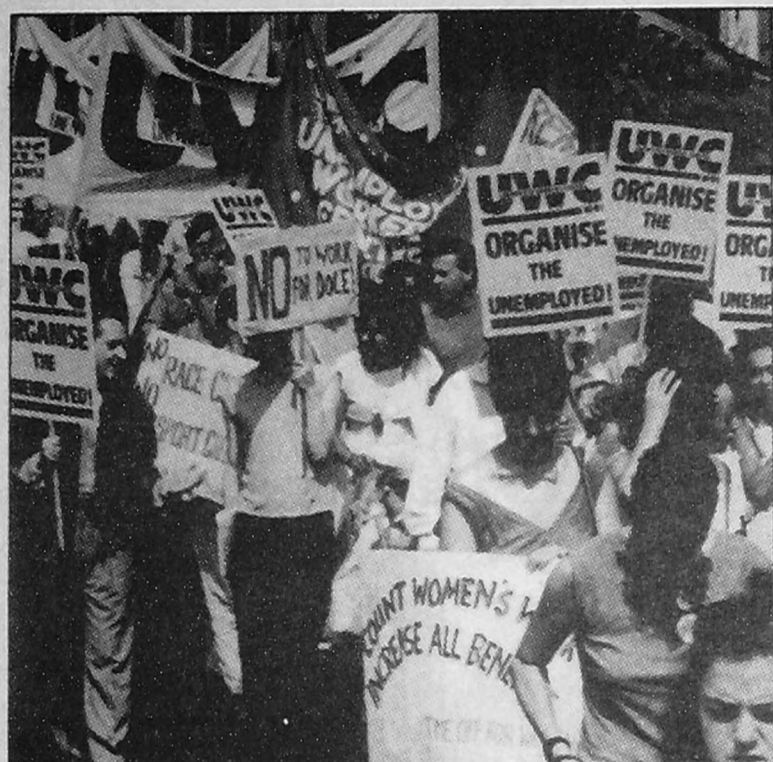
The politics and practice to defend our rights

The October issue of the London District Euro CPGB Bulletin, Capital Communist is, it says, all "about growth". You could have fooled us. London combined with the Eastern District to swell attendance at its weekend school to six "of the newer" members, equaling the number of tutors! In Newham borough, three branches have joined forces in a new 29 strong branch which, because of its size (sic), recognises "the impossibility of us functioning as a unit of the party"! The District's Labour Movement Committee is unable to mail a regular bulletin to its 350 labour movement contacts due to lack of funds, and for the full time staff the "financial summer abyss" threatens "our meagre wages (£26 net a day)". Membership is down from 1,414 in July 1988 to 1,255.