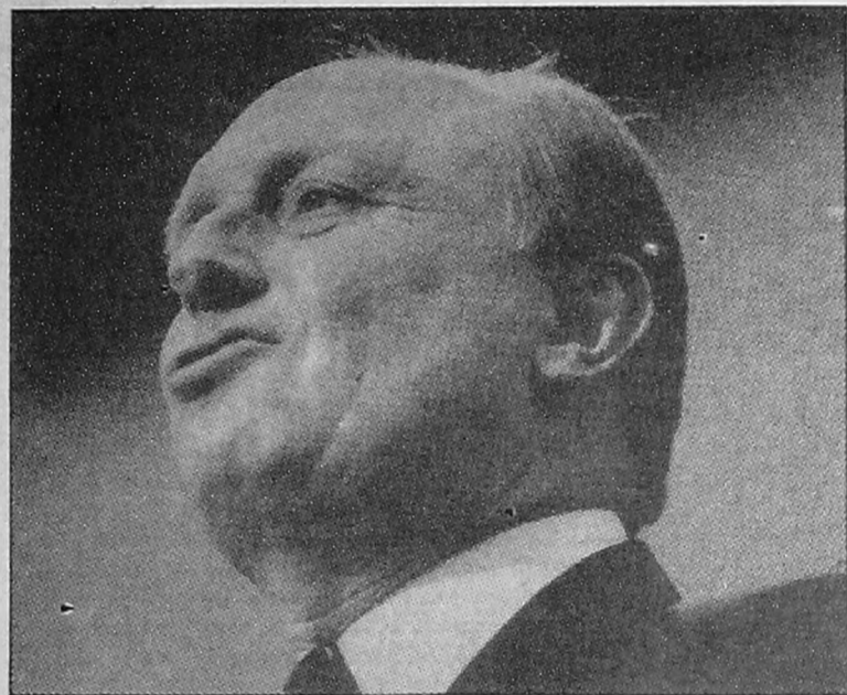
Proving to the bosses his party will support them as well as the Tories

This indicates the schizophrenic nature of the Labour left. It retains its base in the working class by lending support to their struggles, in particular the economic struggles of the trade unions. Rather than giving even these limited struggles an independent lead, they must instead channel these energies into electoralism and the confines of the Labour Party. By definition, then, the Labour left is