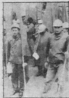
Workers from Turkey showing their proletarian internationalism in London on May Day. Now is the time for British workers to show their solidarity