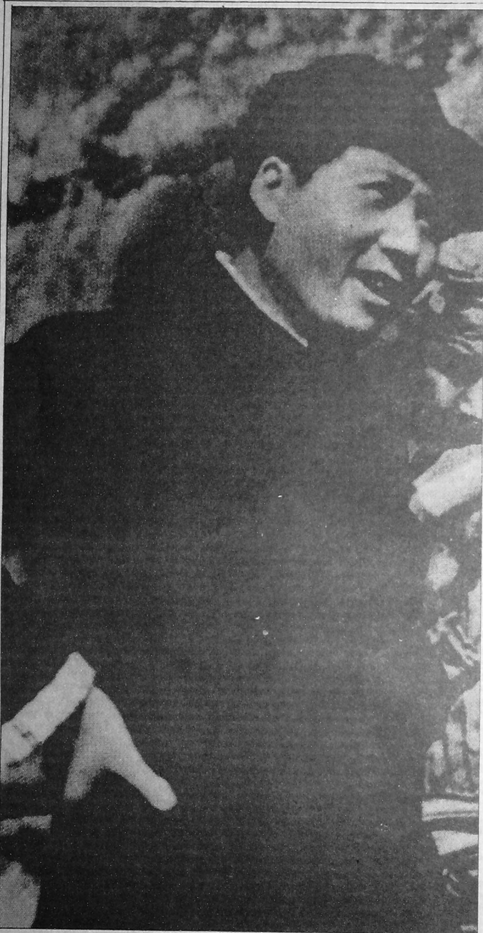
Mao in 1940: organising a revolution

The horrific sight of the People's Liberation Army turning on the people has not only proved the bankruptcy of the leadership of the Communist Party of China. It has done the same thing for much of the left in Britain