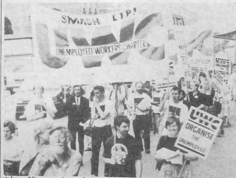
•June 15 - a real step forward

A ROUND 150 people marched through the streets of London on June 15 against Employment Training. In different parts of the country on the same day, hundreds of activists took part in marches, strikes, occupations and pickets. June 15 was a real step forward in the fight to build a national unemployed workers movement and a fighting unity between the employed and the unemployed.