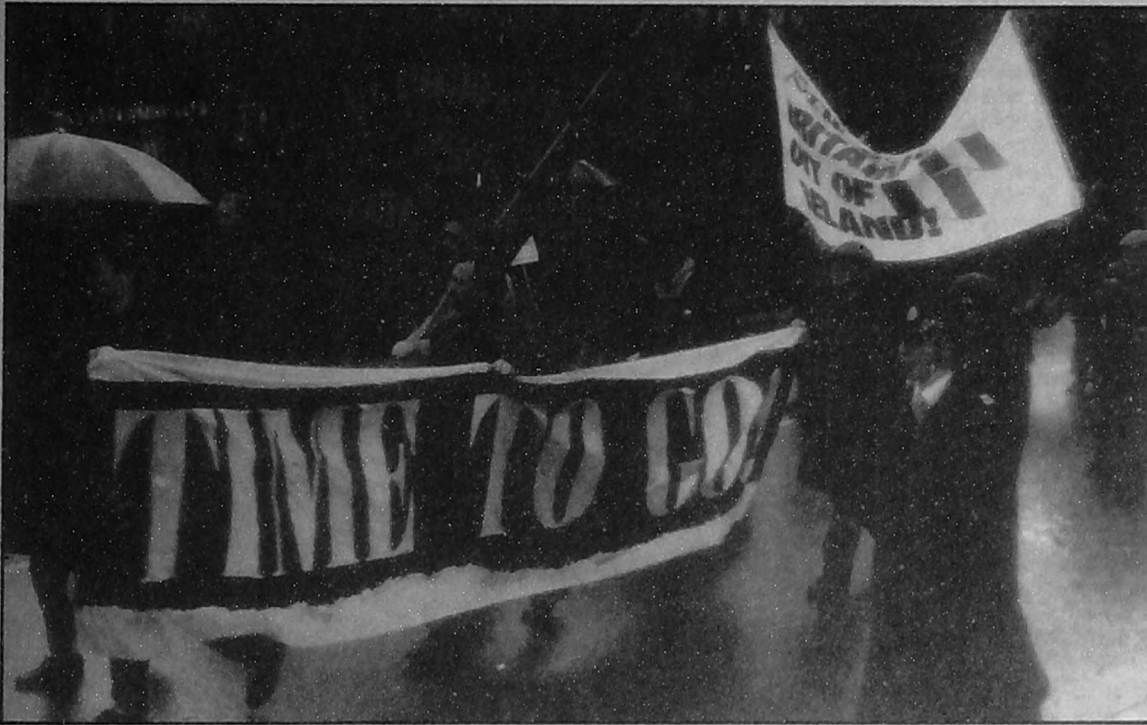
"Disciplined, organised and militant"?