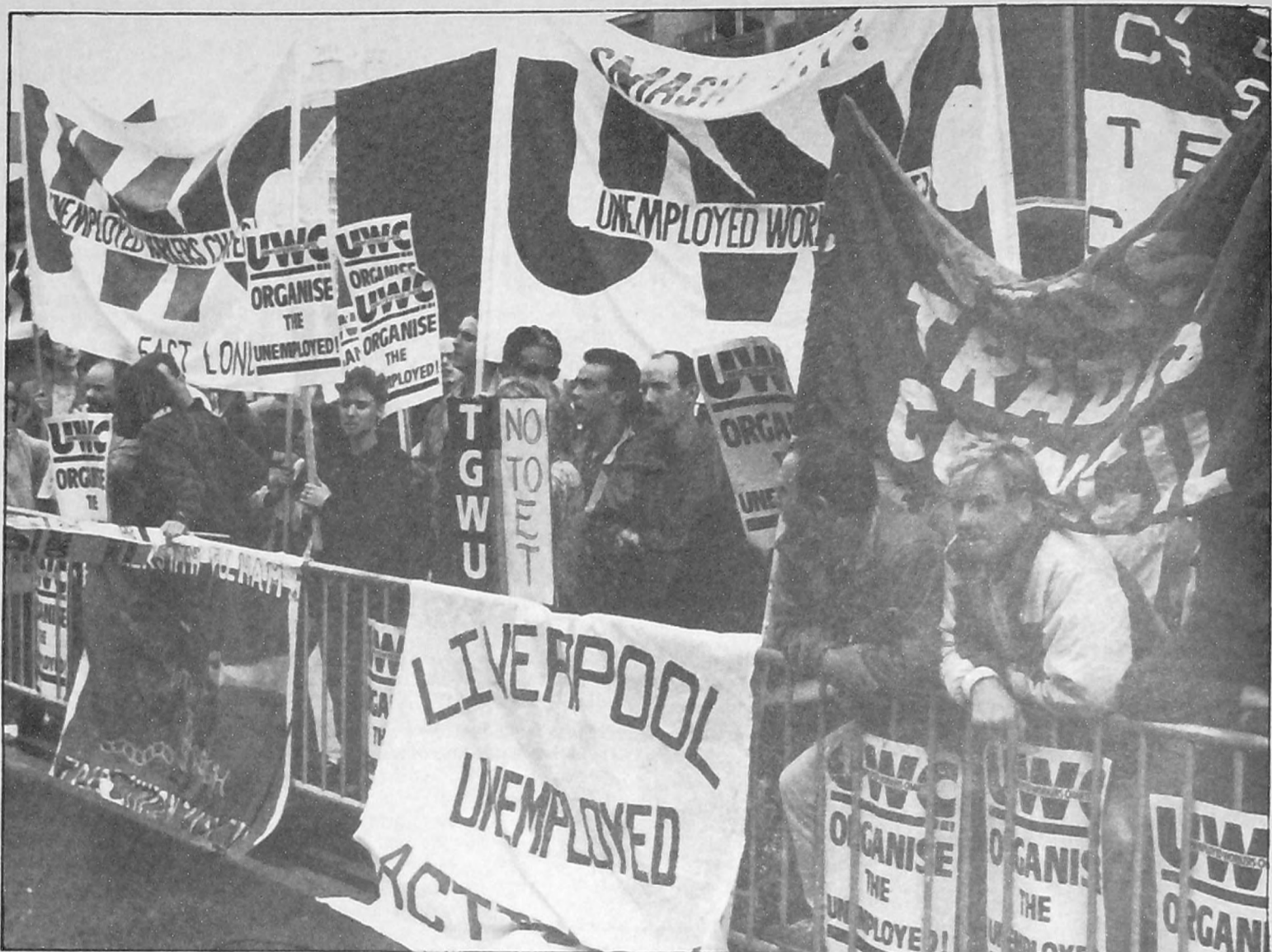
Fightback with the UWC

The UWC has embarked on this fight. It launched an ongoing campaign to smash ET with a large and militant lobby of this year's TUC congress in Bournemouth, demanding that it boycott ET.