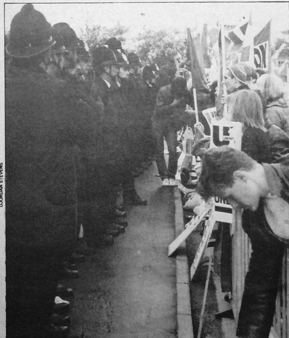
Face to face with the British state

The UWC is burying the defeatist lie that all that can be done is to lie back and take it, to