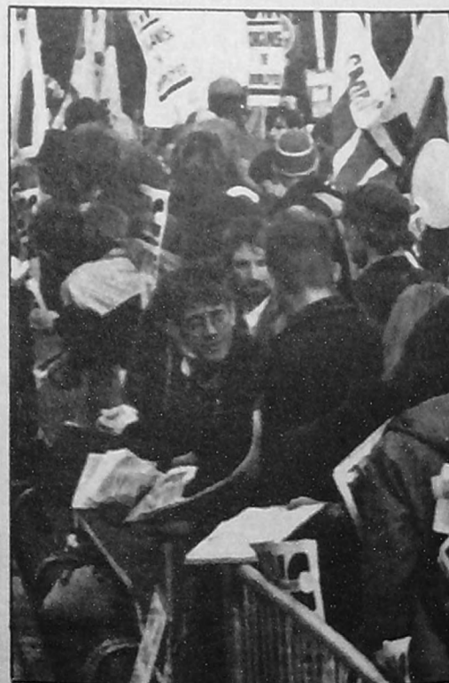
Lobbying the TUC

We were in no way deterred by this, and kept up our chanting from 8.30am to 11am.