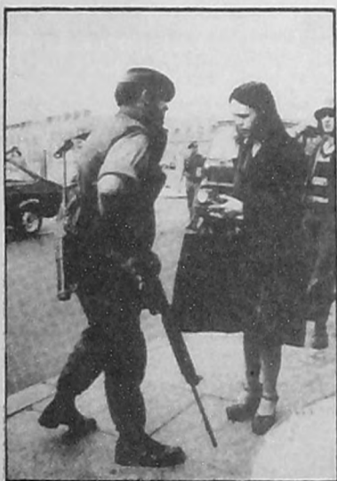
When wasn't it time for them to go?

The Leninist has put forward an initiative based around these slogans. In mid September, with the support of the Irish Republican