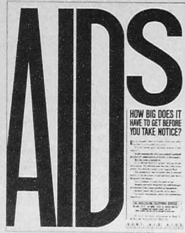
The AIDS virus

The state is stepping up its scare-mongering campaign about the 'gay plague' AIDS. Communists must take sides with the oppressed.