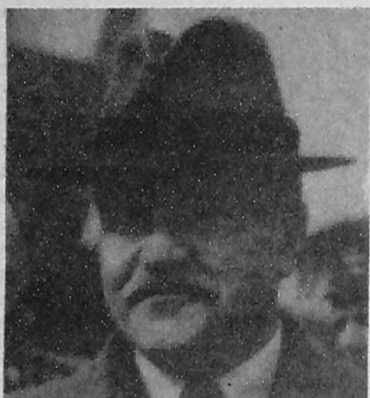
Molotov: Stalin's faithful lieutenant

Even before the death of Lenin, Molotov lined himself up with the centrist tendency headed by JV