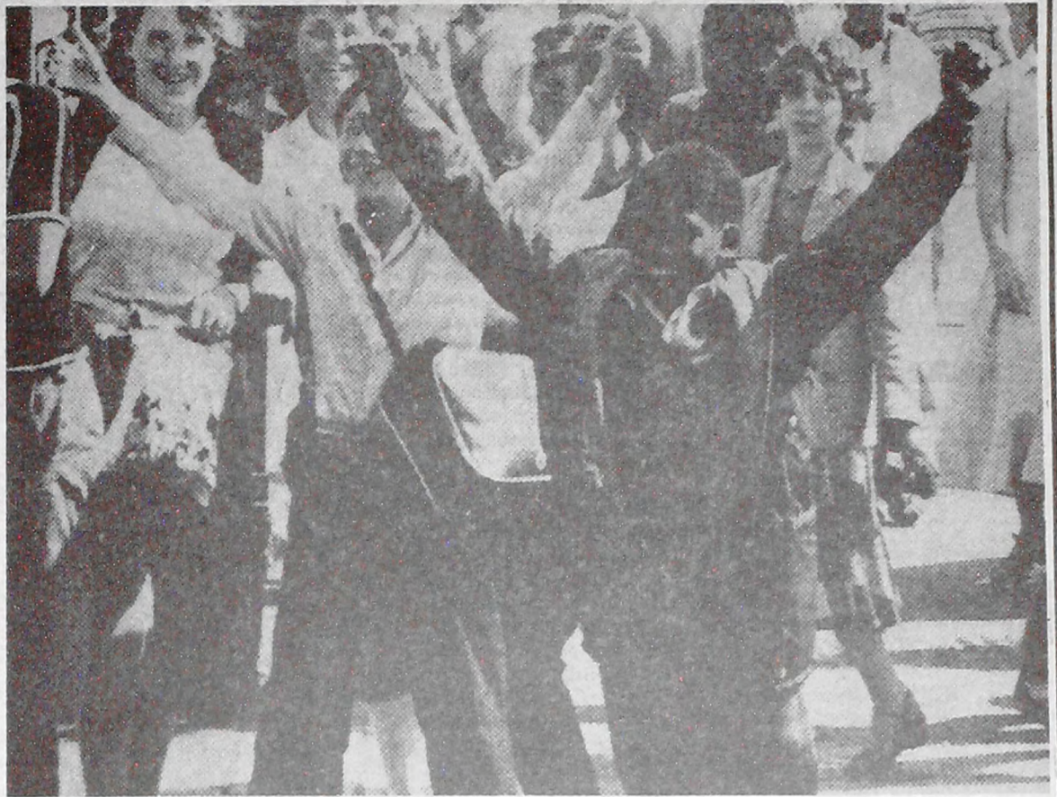
Why support Brent council?

Compared with Labour the Tories have a broadly similar approach to 'ethnic minorities'. There is a 1,000 strong Tory 'black section' in Brent and partially due to its cultivation of a pro-black veneer the Tories managed to gain control