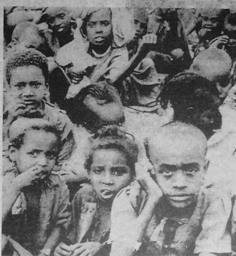
Ethiopian famine victims: under the yoke of imperialism

It is torn between two options: to impose fiscal and monetary stringency to try to force debtors into repaying debts, or to provide extra credits to tide the debtor over the crisis. Its problem lies in the fact that