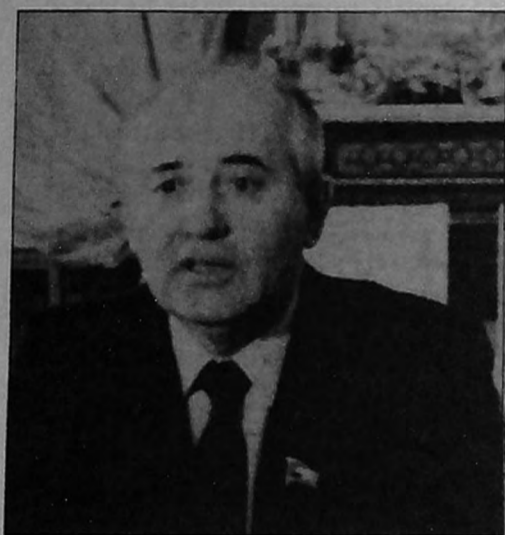
The new ruling class wants to put Gorbachev in the dock. Now there's gratitude for you

If the crisis of bureaucratic socialism had been resolved positively, the likes of Gorbachev, Yeltsin and Honecker would have been forcibly overthrown, the new proletarian courts no doubt sentencing them to a brief period of re-education and then retirement on a modest state pension. The counterrevolutionary trials now beginning have an altogether different agenda