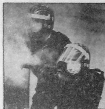
Traditional summer wear for the British police

no training has been exposed by the recent figures showing that the percentage of those on YT leaving with any kind of qualification has fallen from 38% to 35% between March and July 1991. Unemployment rose from 20% to 23% during the same period. The government's boast of providing a place on YT for all those who 'want' (read 'are forced into') one is a joke, which would be a blessing, were it not for the fact that if you are in that age group and unemployed, you get nothing. As things stand, this is contributing to the growing