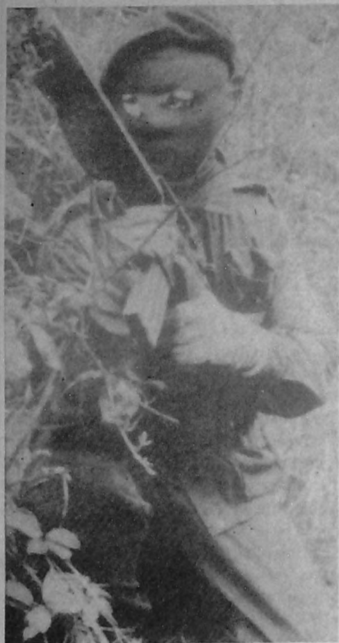
Transforming the heroism of Ireland's freedom fighters into mass insurrection needs a Communist Party

A former editor of The Irish Marxist looks at the main constituents of the republican and socialist movements and highlights the need for a genuine Communist Party in Ireland