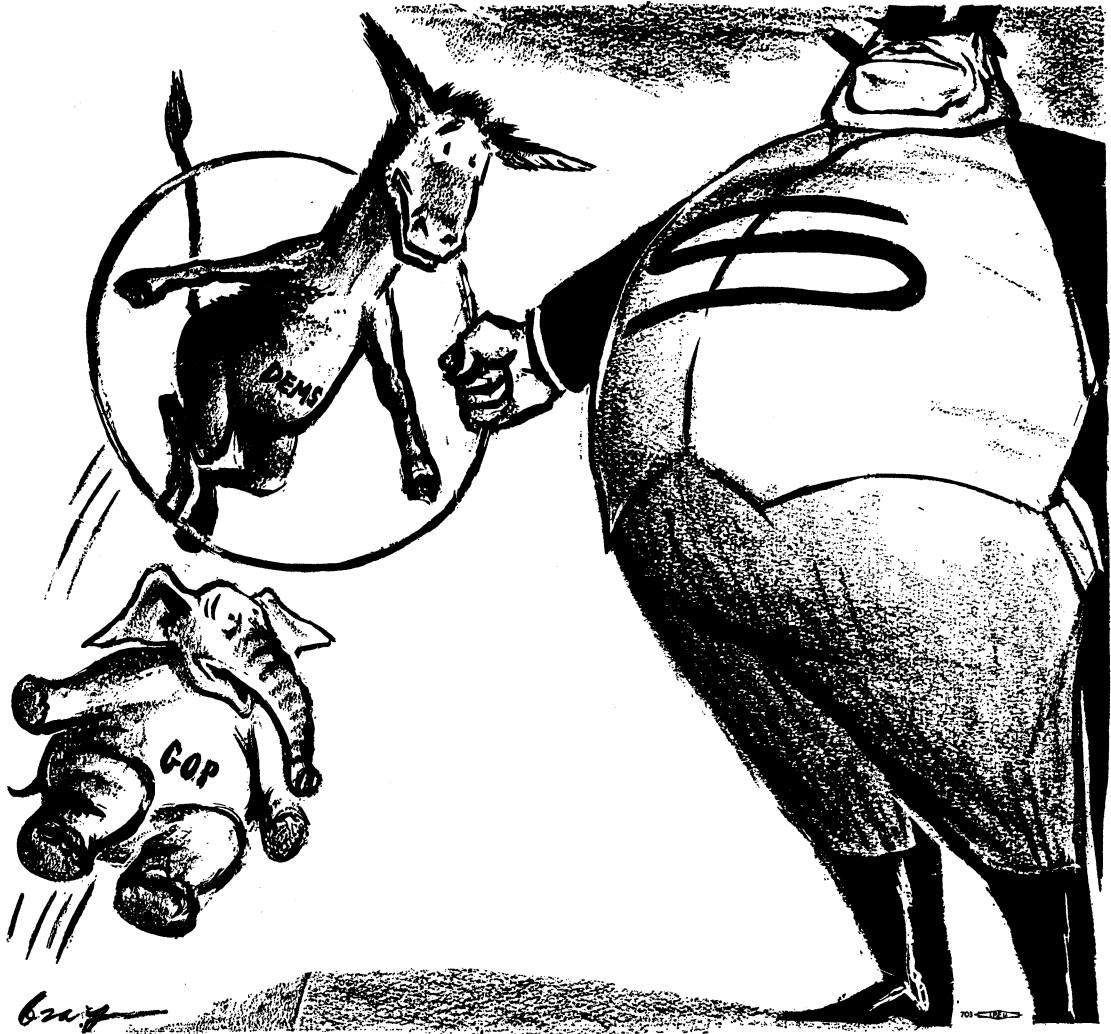
WELL-TRAINED, NO? This cartoon by the late Laura Gray — perhaps the greatest political cartoonist of our time — first appeared during the 1952 campaign.