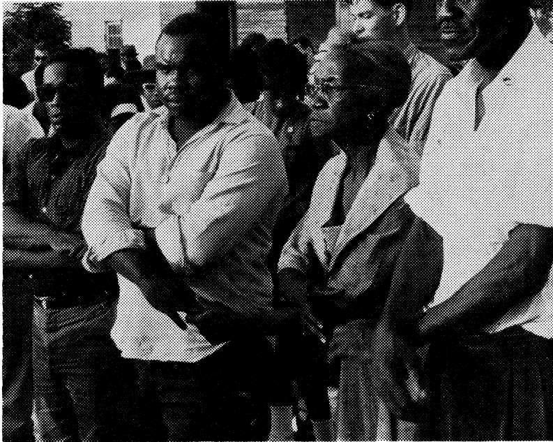
ALBANY, Ga. Nation-wide civil-rights struggle is the way to guarantee these Southern freedom fighters victory.

Reape said that a Monroe civil-rights demonstration in which he had participated had been attacked by a racist mob of 5,000. "When we got back to our section of town, we stayed out in the streets. A white couple drove into the neighborhood but could not proceed because of all the people in the streets."