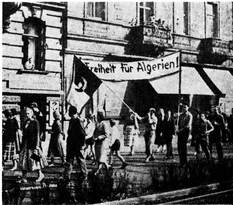
GERMAN YOUTH DEMONSTRATE. Demand Freedom for Algeria on May Day, 1958. The established Left in all of Europe remained silent.

magazine declare how nice it is to own a private cottage (built by a contractor from you-know-what class) and drag on with stories of sports at their camps and pictures of Fräuleins doing the [American] twist. Internationalism, presumably.