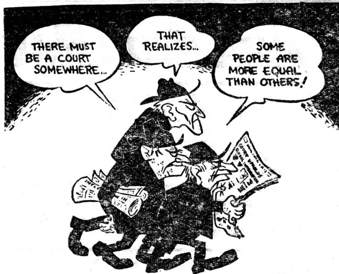
(Etta Hulme in Texas Observer)

Elvis Presley: "I consider rock n' roll the greatest music on earth. It is very noteworthy, and namely because it is the only thing I can do."