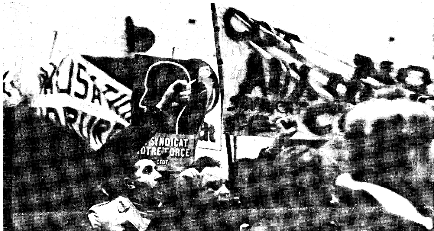
Steel workers demonstrate outside headquarters of Usinor trust in Paris in December.