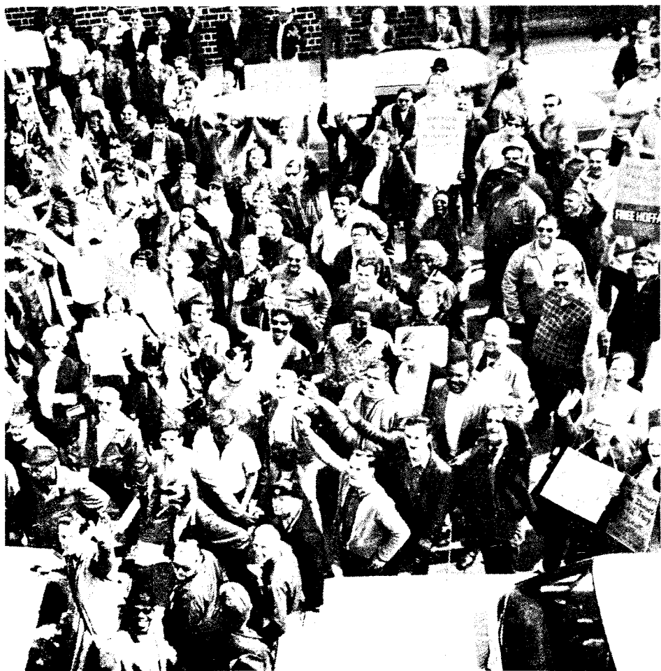
Militant Ohio Teamsters wildcat in 1970. Same National Guard unit which tried to break their strike shot the Kent State students.