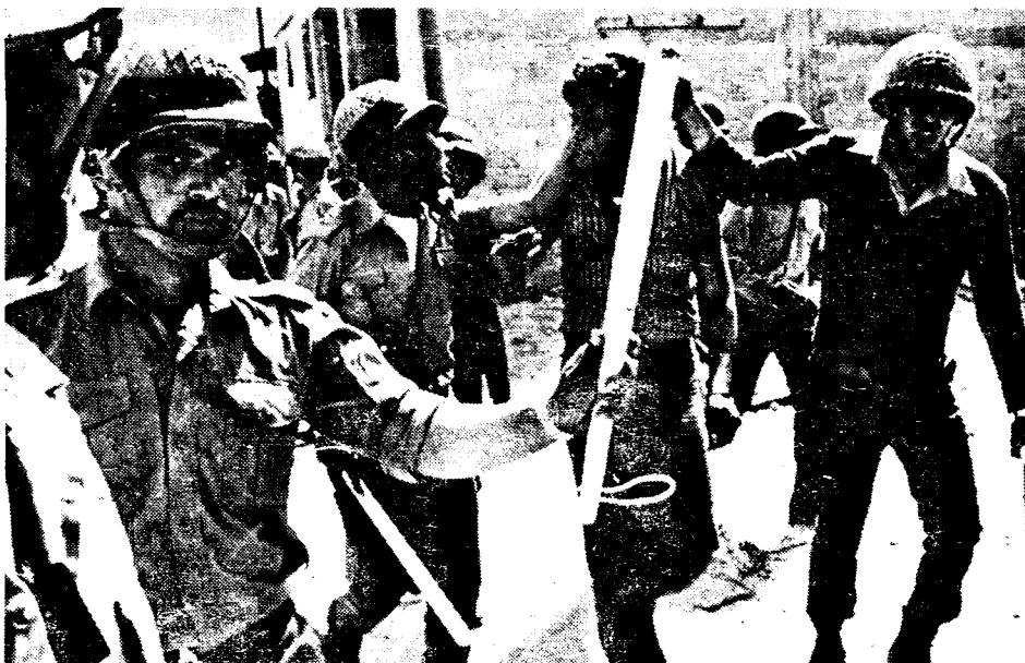
Carter says "Peace has come." Not for the Palestinians.

dubbed by Arab states of the "rejection front," and in this they were certainly correct. As the obsequious Sadat put it in trying to ingratiate himself with his new patron, "Jimmy Carter has done it. This show is his show." Not only was the Egyptian-Israeli "peace" treaty negotiated under U.S. auspices, but it presages a massive escalation of American military involvement in the Near East. Billions of dollars of military aid will flow to Egypt and Israel, and a