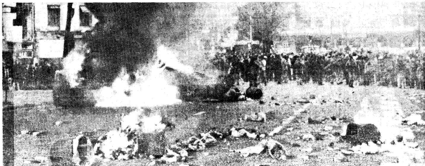
Cops battled demonstrators outside Gare de l'Est in Paris March 23.

Whether by calling a march without focus or by boycotting it, their common concern has been to prevent an explosion of working-class militancy. That is why the Parisian proletariat was not mobilized; that's why there was no mass rally at the end. "Let the workers blow off steam, then send them home." Trotskyist revolutionaries would seek to reach the demonstrators with the demand that a genuine "march on Paris" be built to muster forces for an unlimited general strike for expropriation of the steel trusts and against the capitalist government's austerity policies and layoffs—for full employment and protection against inflation by a sliding scale of wages and hours. It was necessary to combat popular-front illusions that this could be solved simply by putting the reformists and their bourgeois bloc partners in the ministerial chairs—for a "new 68" that goes all the way, workers to power! What the steel workers need now is not simple militancy—that they have plenty of already—but a perspective for victory. ■