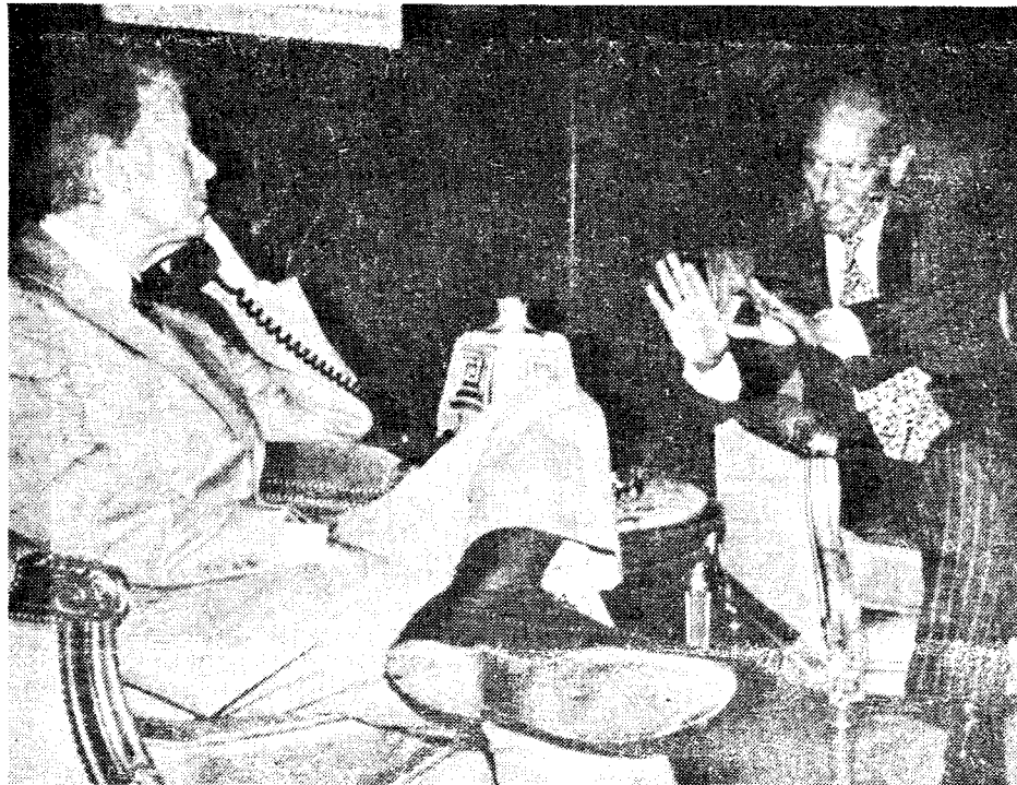
On the phone with Begin: arranging the Pax Americana.

rolled by Saudi Arabia and the oil sheikhs for years. If they needed additional reasons to give them cold feet about joining up with Carter's new anti-Soviet alliance the Saudis need only look at the history of its predecessor, CENTO. Popular opposition to the U.S.-engineered Baghdad Pact was one of the sparks which sent the Iraqi masses into the streets in 1958 and brought down King Faisal, seen as a puppet of the imperialists. With discontent continuing to build in the Egyptian working class, it is an open question whether Sadat will suffer a similar fate.