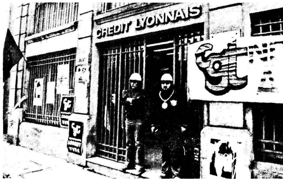
Longwy steel workers take over bank in January.