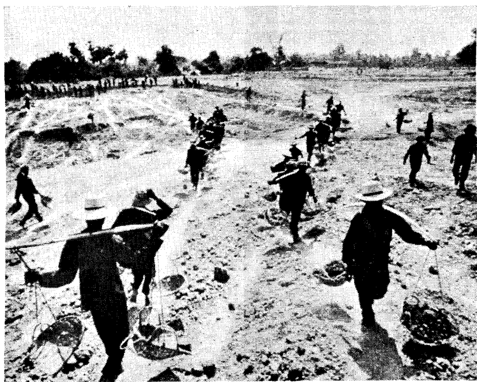
New York Times