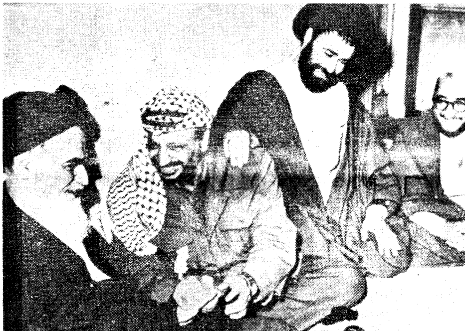
Get this, then we tell them we're for a democratic secular Palestine.

Egyptian/Israeli "peace" treaty. Washington would like to tie this $5 billion package to a new anti-Soviet military alliance in the Near East, modeled on the long-defunct CENTO—the stillborn mid-1950s brainchild of John Foster Dulles.