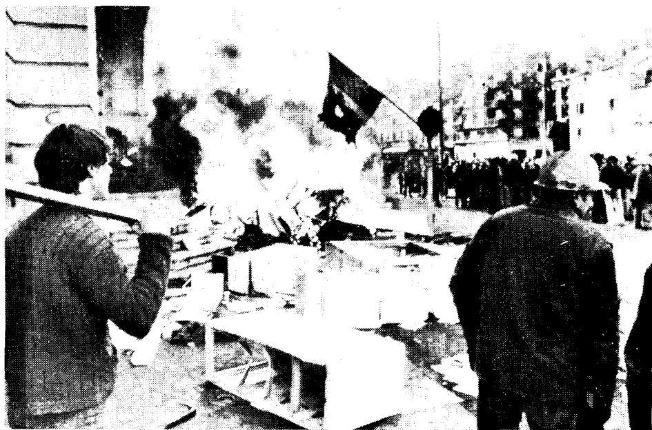
Steel workers outside building of employers' federation in Longwy.