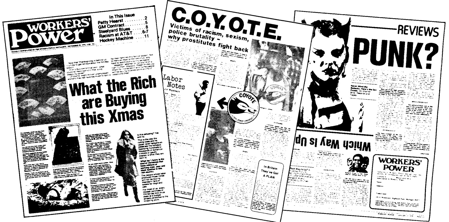
Workers Power: Finally Got the News.

Such a perspective is not fundamentally different from the DSOC scheme to form a "labor party" within the Democratic Party. Indeed, Changes all but openly advocates work within the Democratic Party as part of the liberal/labor coalition. In the "Letter from the Editor" which appears by way of a policy statement, Changes says: "As this [Democrat/bureaucrat]