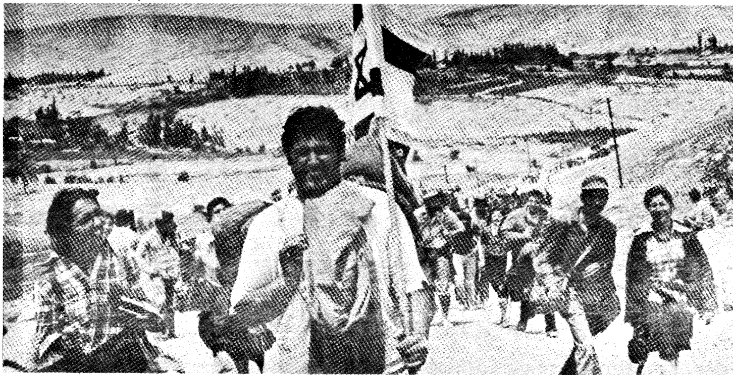
Zionist ultras march to hold Arab land in the occupied territory of the West Bank.

So many of Jabotinsky's tenets are taken as home truths by the modern