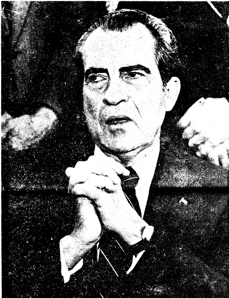
Nixon: "Paranoia for peace isn't that bad."

As for American promises, it was finally confessed last week that the 1973 "peace" agreements included a secret clause committing the U.S. to $4.5 billion in aid to "contribute to post-war reconstruction in North Vietnam, without any political conditions" ( New York Times , 20 May 1977). Not only was the treaty provision repeatedly denied by Nixon-Ford administration officials,