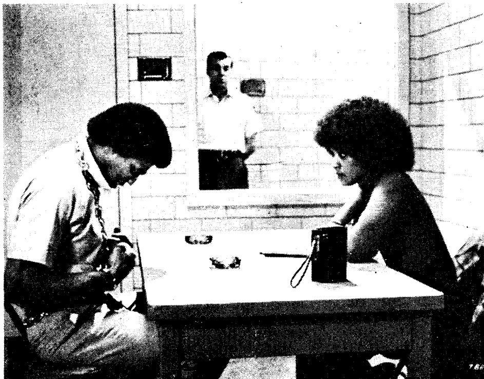
Prison scene from the movie "Brothers."

Brothers reminds us of what Boris Pasternak once said of the Russian poet Maiakovsky, that he "died twice": Once when he committed suicide, and again when Stalin called him Russia's greatest