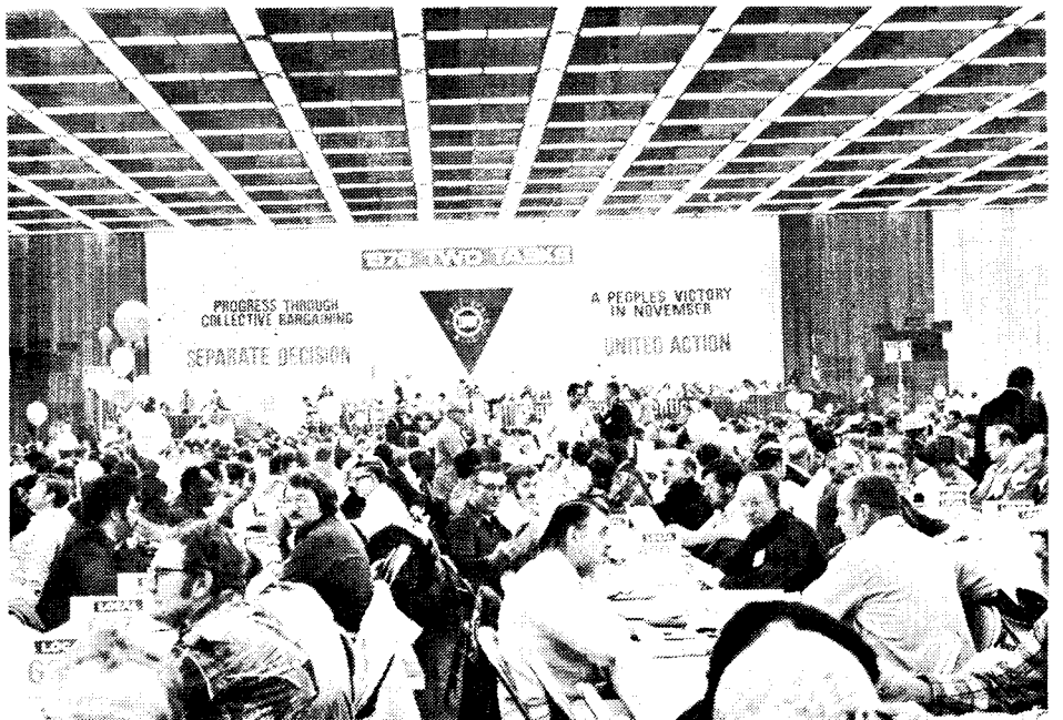
UAW Special Collective Bargaining Convention.

Standing beneath two massive banners reading "Progress Through Collective Bargaining" and "A People's Victory in 1976," UAW president Woodcock outlined in his opening speech the class collaboration which is at the heart of the labor bureaucracy's "strategy." Reviewing the depression-level layoffs that began to hit the auto industry in late 1973 and bankrupted the GM and Chrysler SUB funds, Wood-