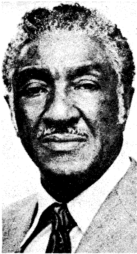
Democrat Ralph Metcalfe

In 1972, Metcalfe ventured outside the Boss's camp protesting the vicious beating of two black dentists. He also supported the ouster of Daley's delegation from the 1972 convention, backing the alternate slate put up by Jesse Jackson, head of People United to Save Humanity (PUSH) and independent Democrat William Singer. Metcalfe's rift with the mayor was not decisive.