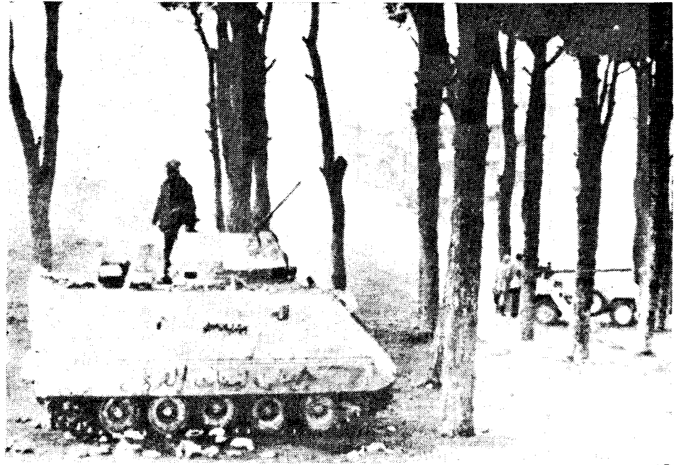
"Lebanese Arab Army" tank in position near Beirut.