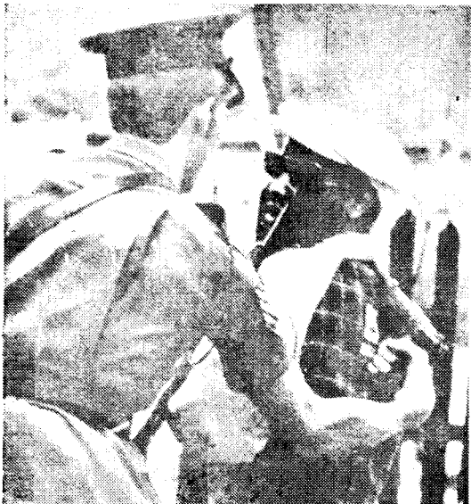
South African policeman holds a pistol to head of demonstrator outside Supreme Court building in Johannesburg where blacks are being tried for violation of Terrorism Act.

As the IC digs itself deeper into the grave of irrelevance, the growth and programmatic cohesiveness of the international Spartacist tendency uniquely demonstrate that principled struggle against Pabloist revisionism is the means for the re forging of the Fourth International.