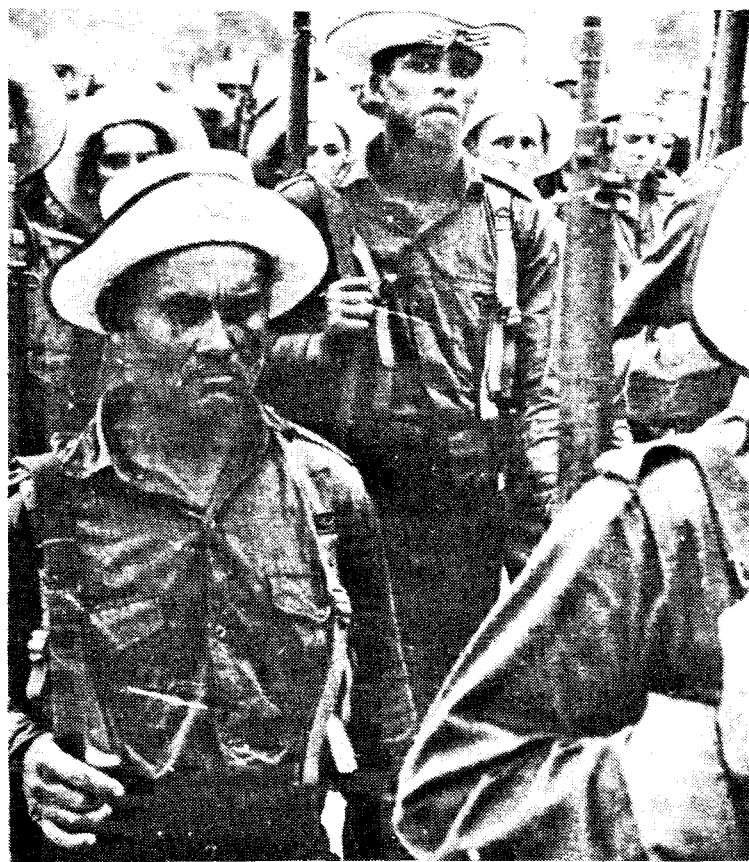
Right: Workers militia in Cuba during early 1960's. Below: Headquarters of Radio Rebelde in the Sierra Maestra.

The Castro-Chibás-Pazos manifesto called for "democratic, impartial elec-