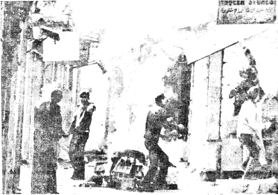
Arab youths protesting Israeli occupation of the West Bank burned crates in the streets of Jerusalem.