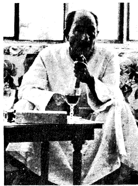
Egyptian president Anwar Sadat

For Muslims, on the other hand, Haram es Sherif is the third holy place after Mecca and Medina. It is here, they claim, that the prophet began his ascent to heaven, and it is here that Muslims built the mosque of Aqsa. Previously, even under Israeli occupation Haram es Sherif has been closed to visitors during times of Muslim prayer and all non-Muslim prayer has been banned.