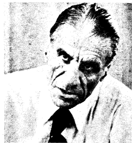
Pierre Gemayel, head of the Phalange.