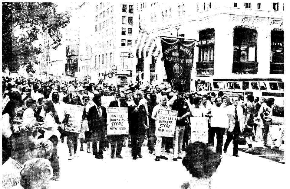
Transport Workers demonstrate last July in New York against fare increase and layoffs of city workers.

The labor hacks also assented to the other part of the capitalist austerity program—a vicious assault on essential social services which has meant a 40 percent increase in transit fares, crip-