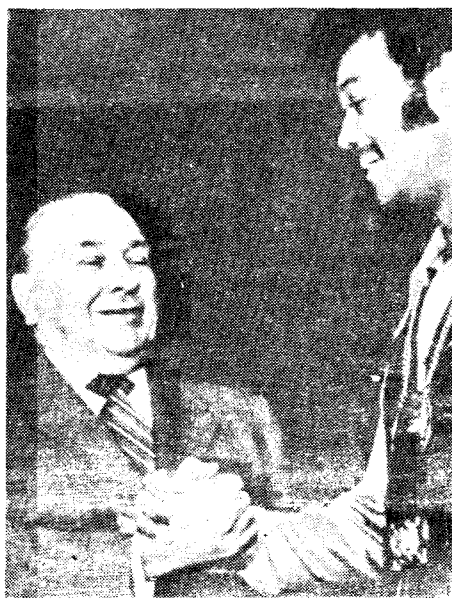
Mayor Daley and Rev. Jesse Jackson