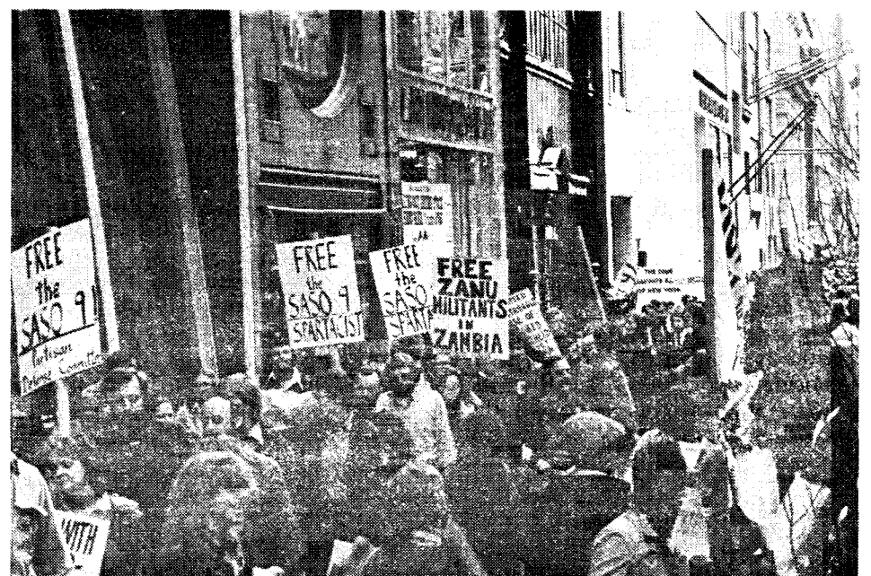
New York City, March 20.