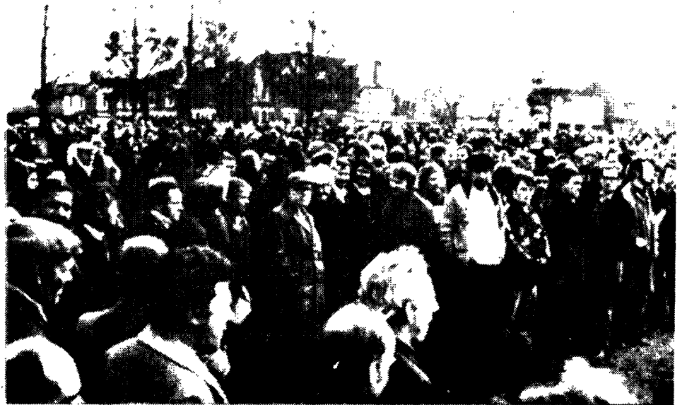
Mass meeting of Chrysler workers at Coventry in November.

In addition, the 25,000 auto workers facing layoffs threatened militant resistance to the move. The Linwood workers demanded that the government nationalize their plant and voted to occupy it if closure threatened. Shop stewards at the Coventry engine plant voted on December 1 to prepare for a plant seizure, and Ryton workers empowered their stewards to take "all necessary action" to stop the shutdown.