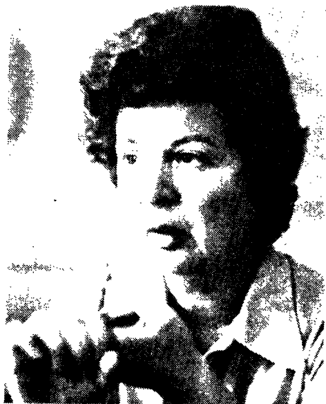
Sara Jane Moore