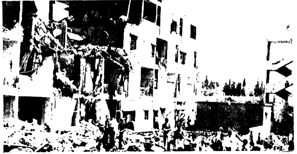
Bombed-out Palestinian refugee district in Beirut.

Contributing to the growing rift between Israel and its imperialist patron is the increased U.S. willingness to consider the "PLO option," especially if that option were translated into a Bantustan-like "mini-state" in the Jordanian West Bank. The major imperialist powers have learned that neo-colonial "self-government" is cheaper and more stable than direct military occupation, and in the West Bank it is U.S. coffers which pay the bills of Israeli occupation. Such a mini-state would be either a vassal of the Hashemite Kingdom of Jordan or a client of the feudal petroleum sheiks of the Arabian peninsula to which the PLO is already mortgaged.