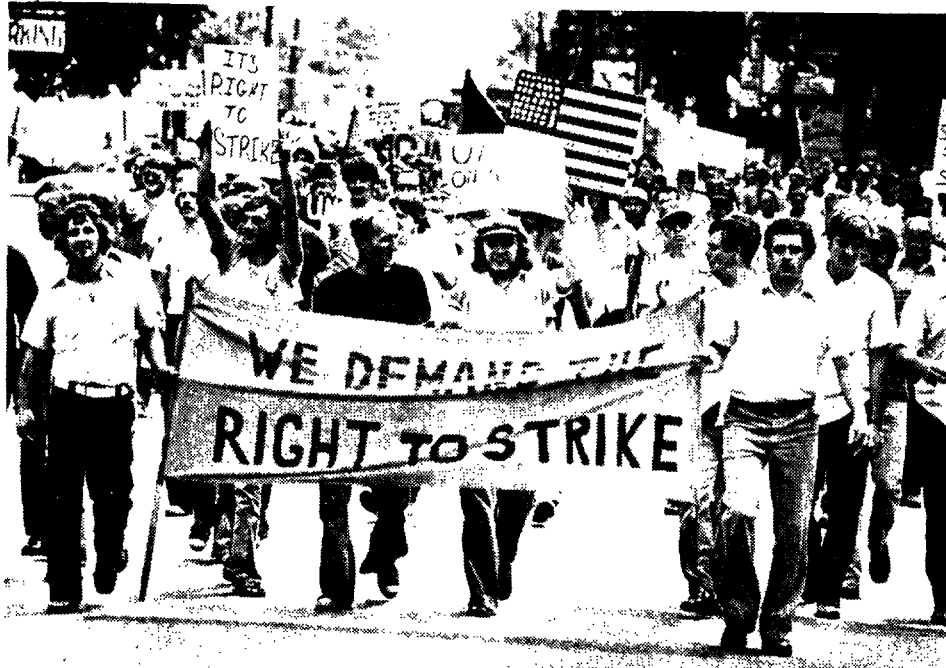
Charleston Daily Mail

What is the cause of the accelerating inflation? It is mainly an attempt by capital, particularly in the monopolistic sectors, to increase profit margins. During the first nine months of 1975, the share of profits in national income rose from 8.2 to 10.0 percent, while the share of wages and salaries fell from 76.1 to 73.5 percent, quite a significant shift by historic standards. In addition, rising prices are the other side of the U.S. balance of trade surplus. A lower-valued dollar means that all imports are more costly in the U.S. market, and this country's imports are heavily weighted by key intermediate products such as oil and iron ore.