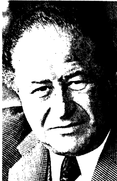
Austrian chancellor Bruno Kreisky

In the October elections the Austrian Bolshevik-Leninists (ÖBL), a sympathizing section of the international Spartacist tendency, called for no support to the Socialist candidates since the SPÖ was obviously preparing a class-collaborationist coalition (see WV , No. 81, 17 October). However, this was contested by the local extension of the centrist German Spartacusbund, which ridiculed the idea that the SPÖ was angling for an alliance with the FPÖ, citing Kreisky's statements that he was seeking an absolute majority and dismissing the local "trial coalition" as