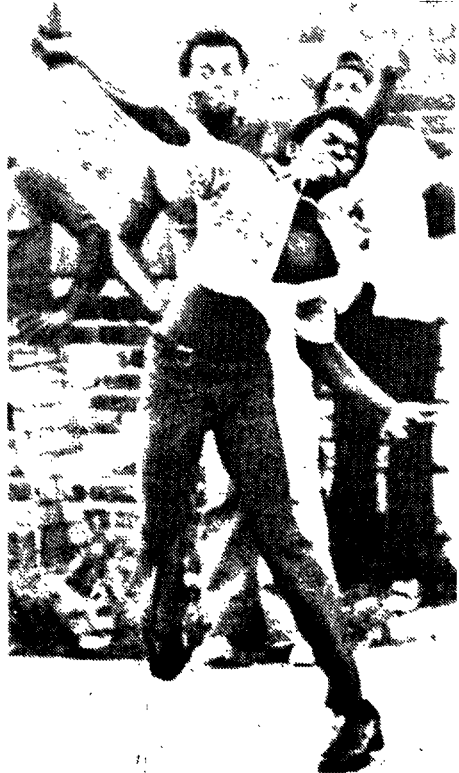
Detroit ghetto explodes in anger after killing of black youth last August.

permanent structural job losses of huge proportions.