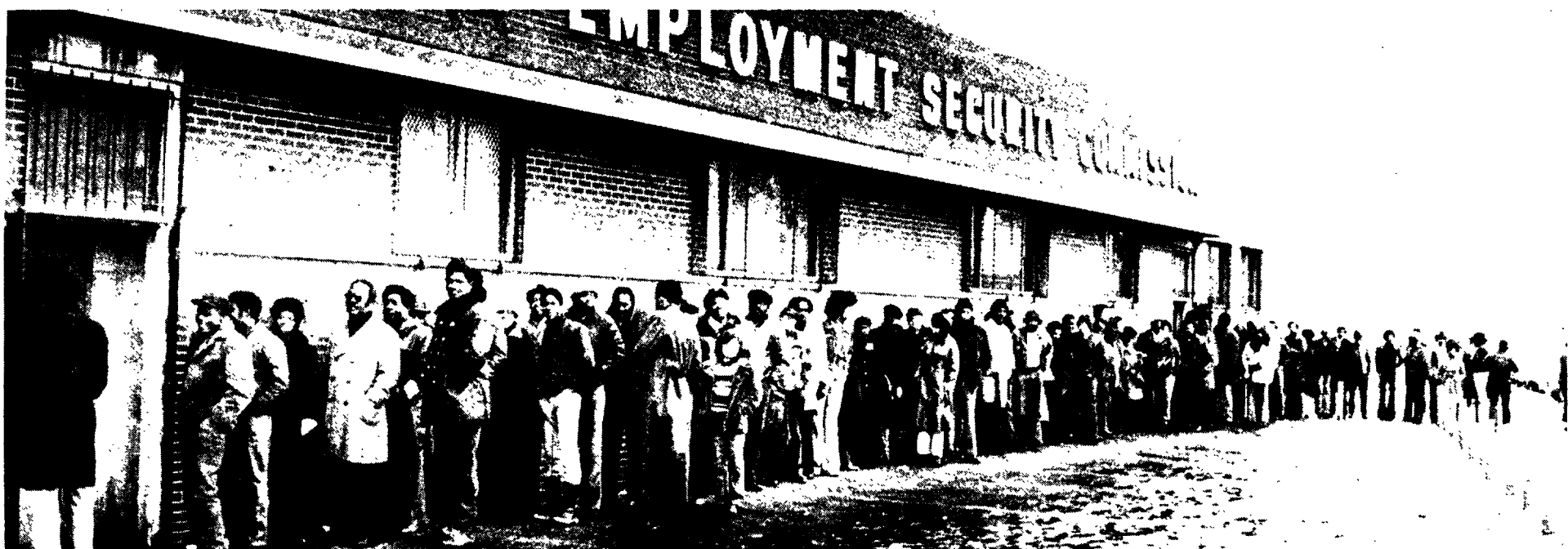
Unemployment lines in Detroit. Inner city jobless rate is estimated at 40 percent in the U.S. auto capital.