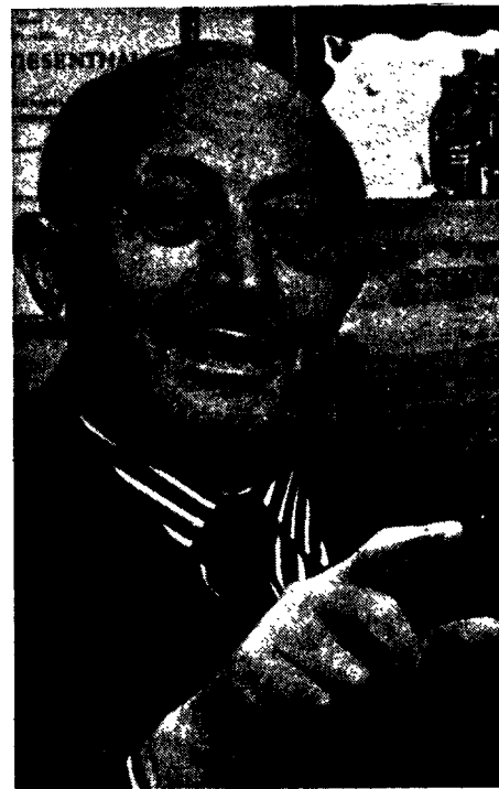
Nazi-hunter Simon Wiesenthal