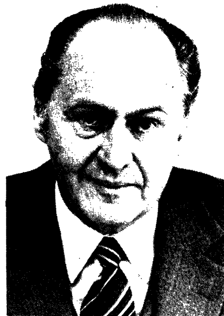
Former SS officer Friedrich Peter

irrelevant ( Spartacus [Vienna], September 1975). Kreisky's victory speech and particularly his violent reaction to Wiesenthal's revelations are further proof that the SPÖ did indeed intend to set up a "small coalition."