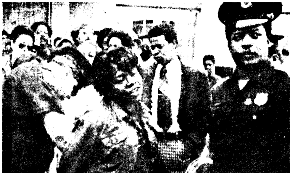
Wilmington, Delaware, police handcuff one of 259 teachers arrested during strike.

While the very calling of a state-wide general strike to back the teachers was a welcome break from the established pattern of letting each union win or lose in total isolation, the poor turnout must be laid at the doorstep of the labor bureaucracy. Since the courts had enjoined teachers and other public employees from participating in the work stoppage, WFT