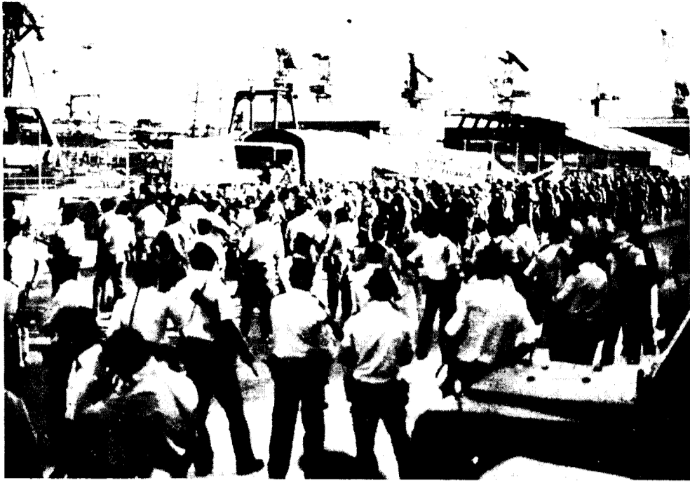
Left: workers commission at Lisnave shipyards leads march of 6,000 against government no-strike law, 12 September 1974. Right: members of "popular vigilance committees" stop cars entering Lisbon to check for arms during attempted rightist putsch, 11 March 1975. Goal of the new Portuguese government is to suppress all soldiers committees and workers militias, and to break the back of workers commissions.