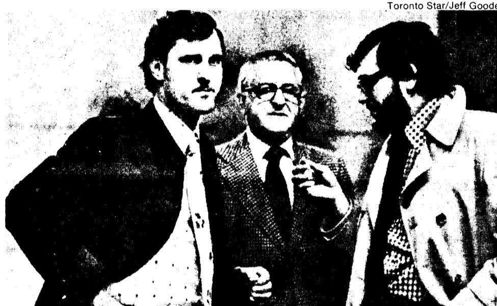
Stephen Lewis (left), leader of Ontario New Democratic Party with father David Lewis (center), former head of federal NDP.

A far more useful policy, one that would have made an impression on the workers disgruntled with the party's