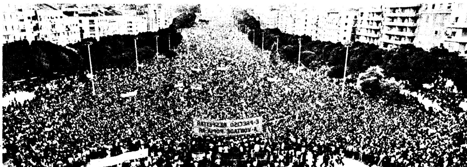
Socialist Party demonstration in Lisbon, July 19.