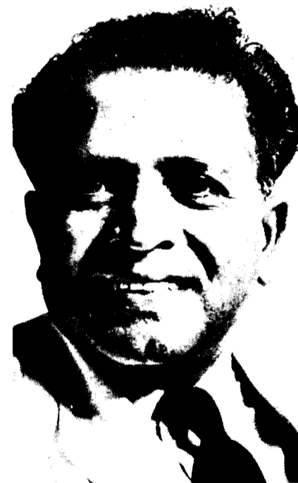
LSSP leaders Colvin R. de Silva (above) and N. M. Perera.

Perera and the LSSP leaders know that at the appropriate moment they broke even this "left front" to form the coalition government with the SLFP in June 1964.