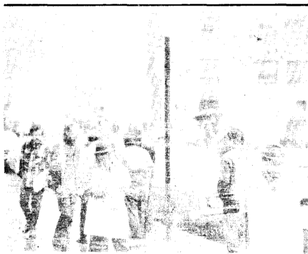
NMU Militants Demonstrate at Federal Building in New York.