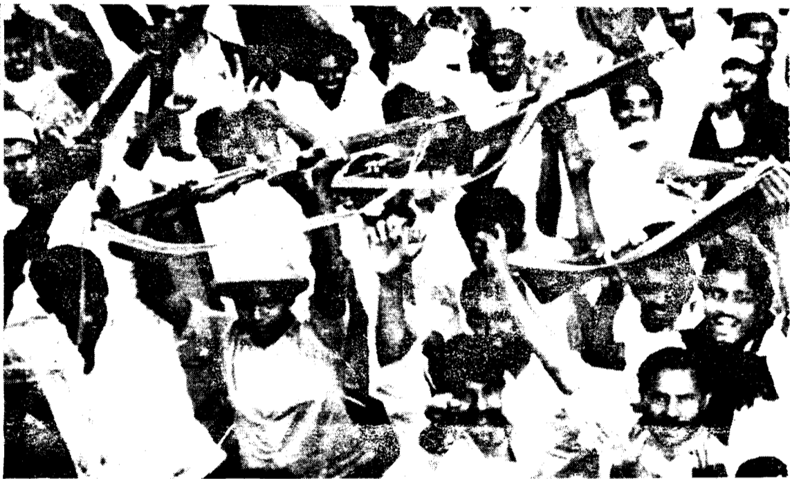
Not for Long the Cheering—Bengalis in Jessore Greet Indian Army.

The power rivalry between Pakistan and India has once more broken out in war. Using the pretext of the just Bengali struggle for self-determination and the refugee problem, India took control of the fighting, with the connivance of the Awami League, in order to accomplish its design of eliminating Pakistan as a serious rival and establishing "Bangla Desh" as a client state.