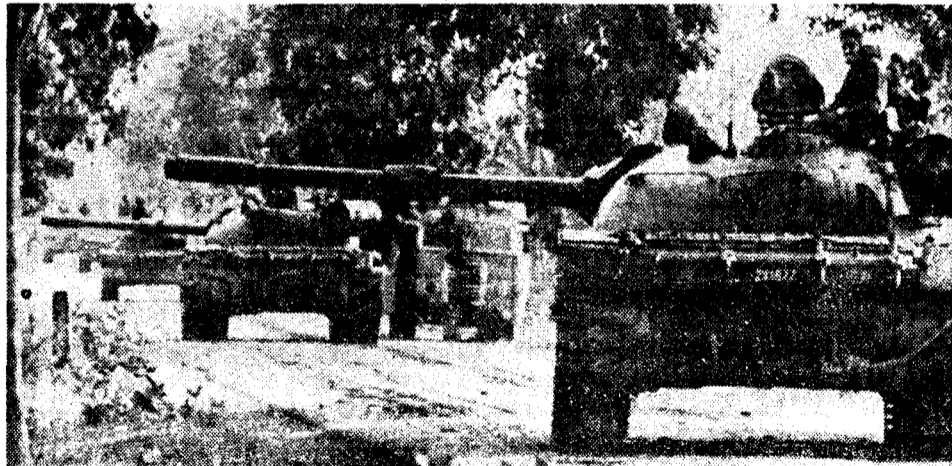
The Real "Heart of the Struggle": Indian Troops Advancing on Jessore.

Bengal may prove to be the weak link in the subcontinental chain, and might be the spark to the socialist revolution in that region. The Calcutta proletariat as part of the all-India proletariat linked to East Bengal by national ties, could with a correct policy advance the world revolution enormously. Lenin in "The Discussion on Self-Determination Summed Up" observed: "The dialectics of history are such that small nations, powerless as an independent factor in the struggle against imperialism, play a part as one of the ferments, one of the bacilli, which help the real