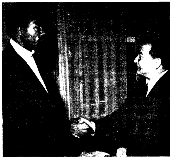
Eldridge Cleaver Greeted by "Anti-Imperialist Prince" Sihanouk.

and soirees, they have not officially abandoned their claim to be the vanguard of urban guerrilla warfare. In the current split, the Cleaver wing points to this contradiction and claims with some truth that Newton's Oakland group has deserted the original Panther banner.