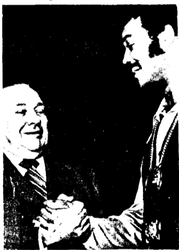
Soul Shake: Chicago's Mayor Daley and Jesse Jackson.

The Panthers' serious internal difficulties, manifested not only in the present decisive split but also in the endless series of expulsions, reflects the impossibility of building a revolutionary organization with street gang methods. Because the Panthers recruited adventurous youth without a stable axis, they could only prevent the disintegration of their organization into competing warlordisms through the imposition of a kind of military terror. New recruits were assigned fifty push-ups for failing to memorize the Panther program, and pressure was put on them to do two hours of reading a day. It is argued that such coerced internal political life is necessary in any radical organization not composed primarily of middle-class intellectuals. But the history of the proletarian socialist movement in the U.S. and elsewhere yields many examples of organizations in which articulate and politically able industrial workers though often lacking formal education, shaped policy, and did not merely memorize a program by rote, like a prayer. This was possible because the socialist movement recruited workers to a comprehensive program for long-term political goals. The Panthers, on the contrary,