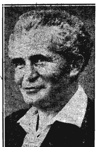
David Ben Gurion