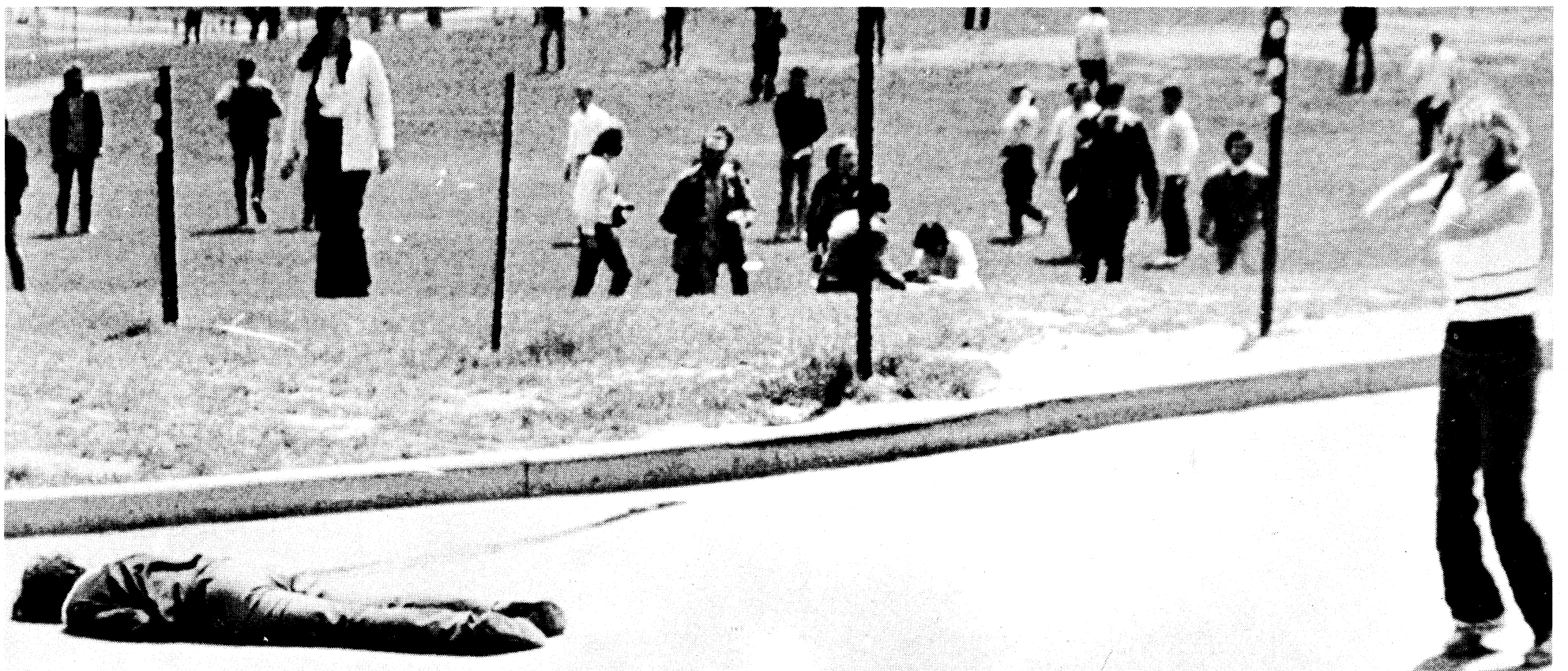
Student holds head in anguish as she views body of one of slain Kent State Four

Several truckloads of Guardsmen pulled up, got out, formed a single line, fixed their bayonets, put on tear gas masks and started (Continued on page 12)