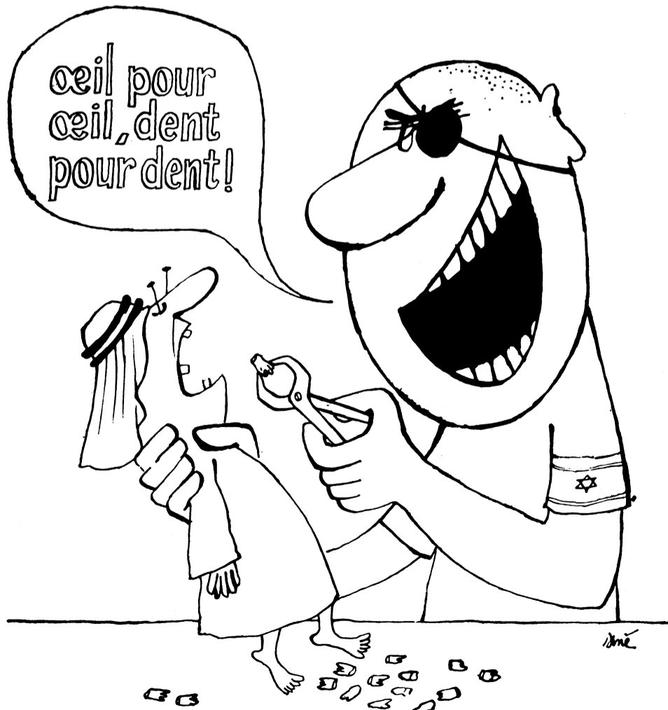
"An eye for an eye, a tooth for a tooth"