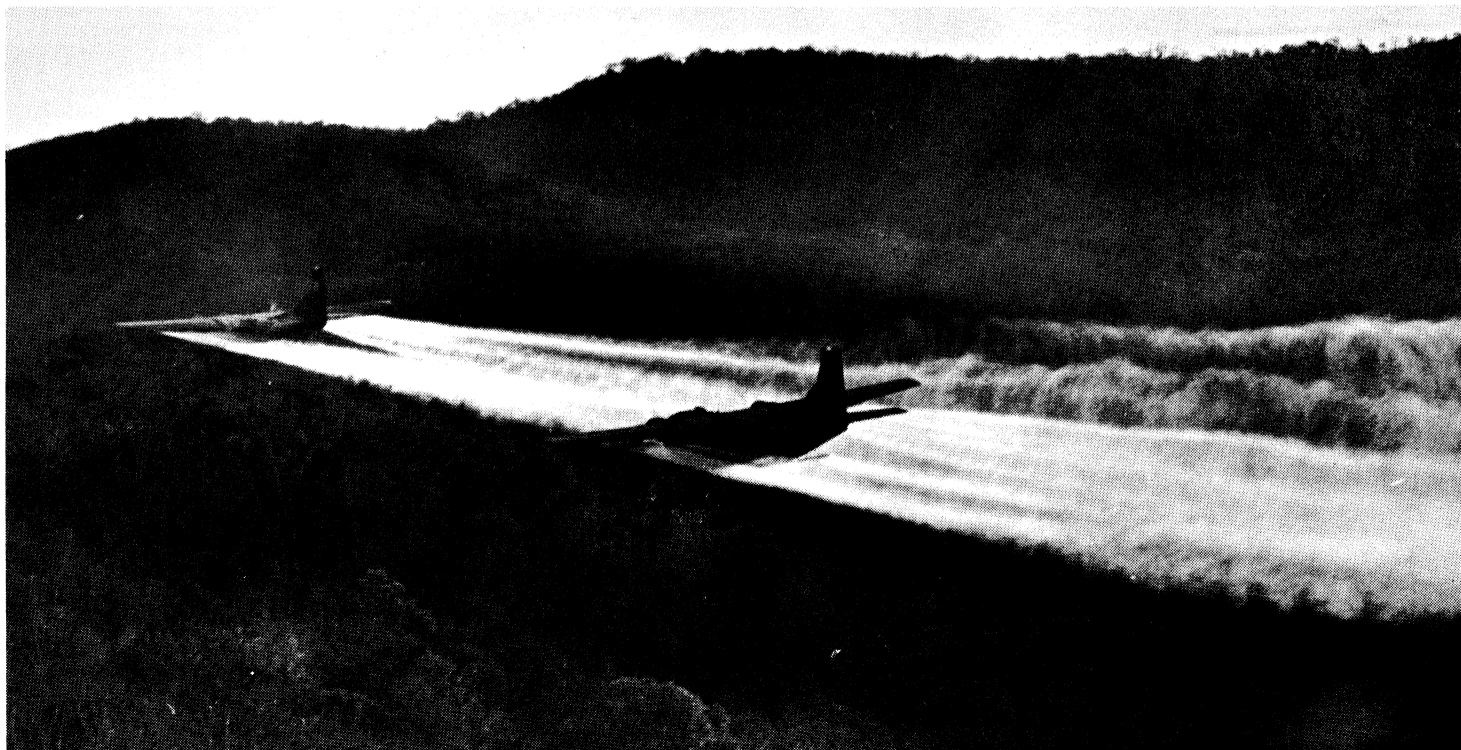
U.S. planes plunge into Cambodia spewing defoliants

Thus the old empires centered in Britain, France, the Netherlands, Belgium, and Portugal have either been