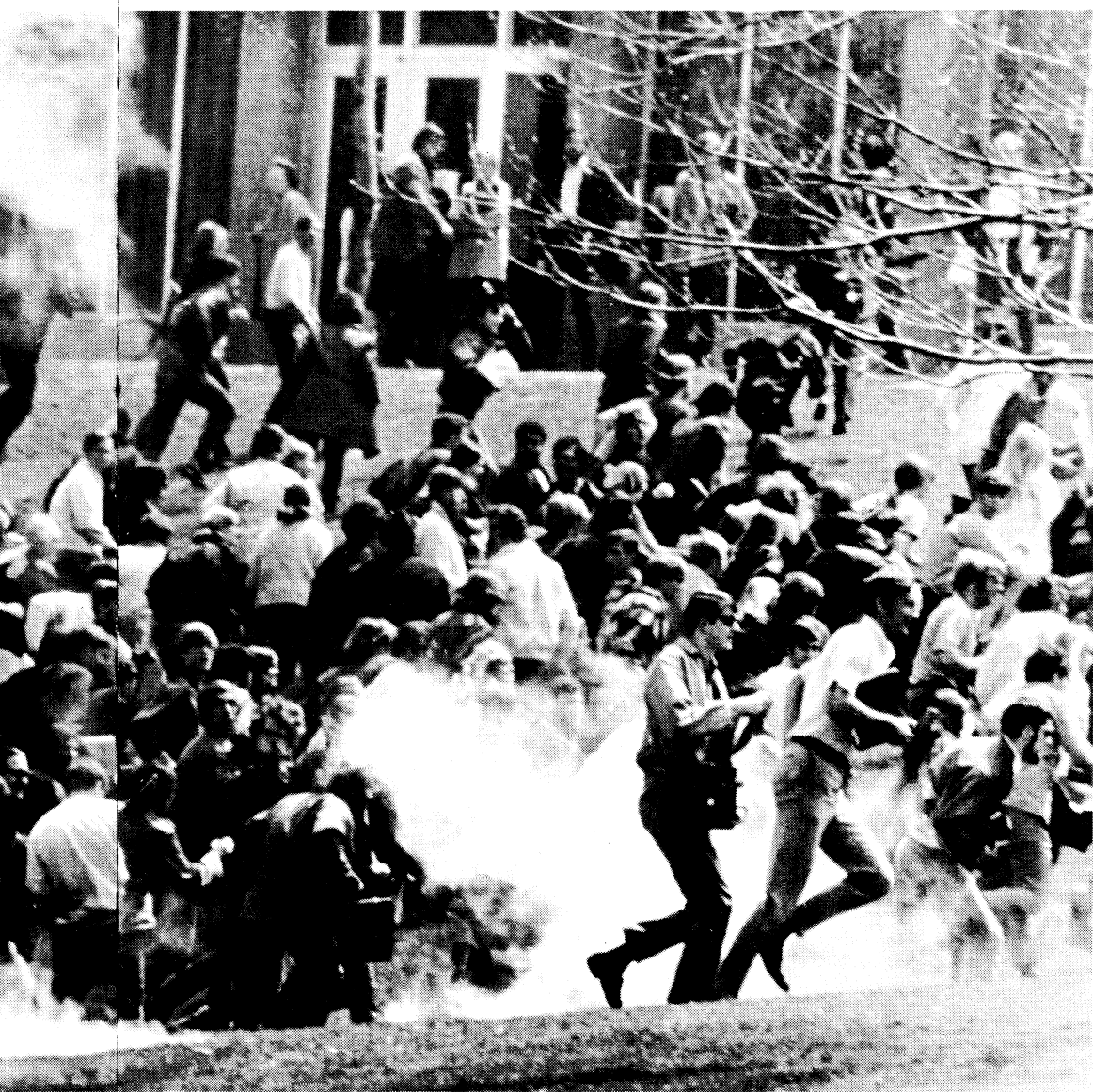
Tear gasperses students at Kent State University, May 4

the war. Further actions are being planned.