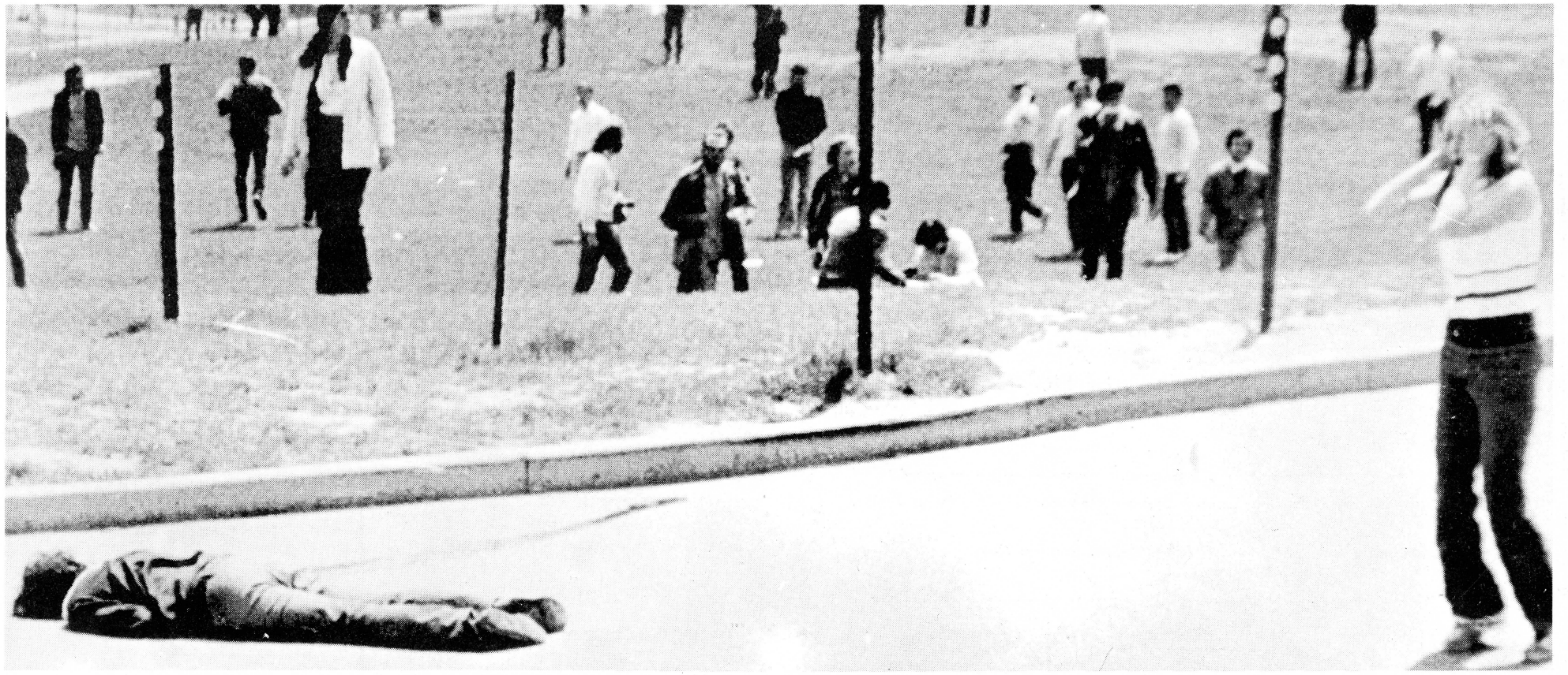
Student holds head in anguish as she views body of one of slain Kent State Four