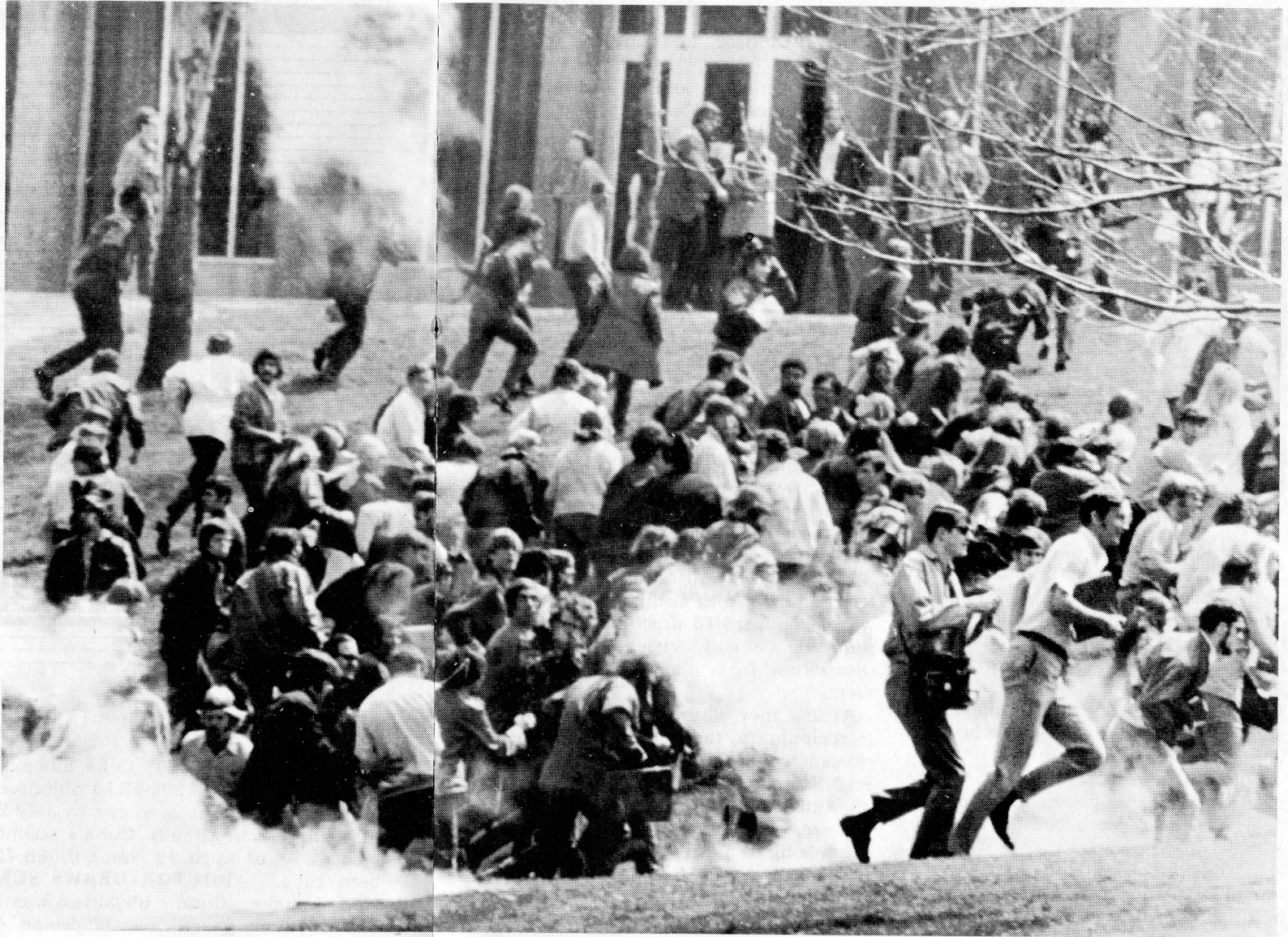
Tear gasperses students at Kent State University, May 4