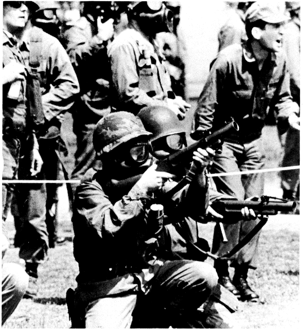
Ohio Guardsmen fire tear gas at Kent students

Each of us tried to go to sleep last night. But you can't. You put down your head, and you keep hearing shots.