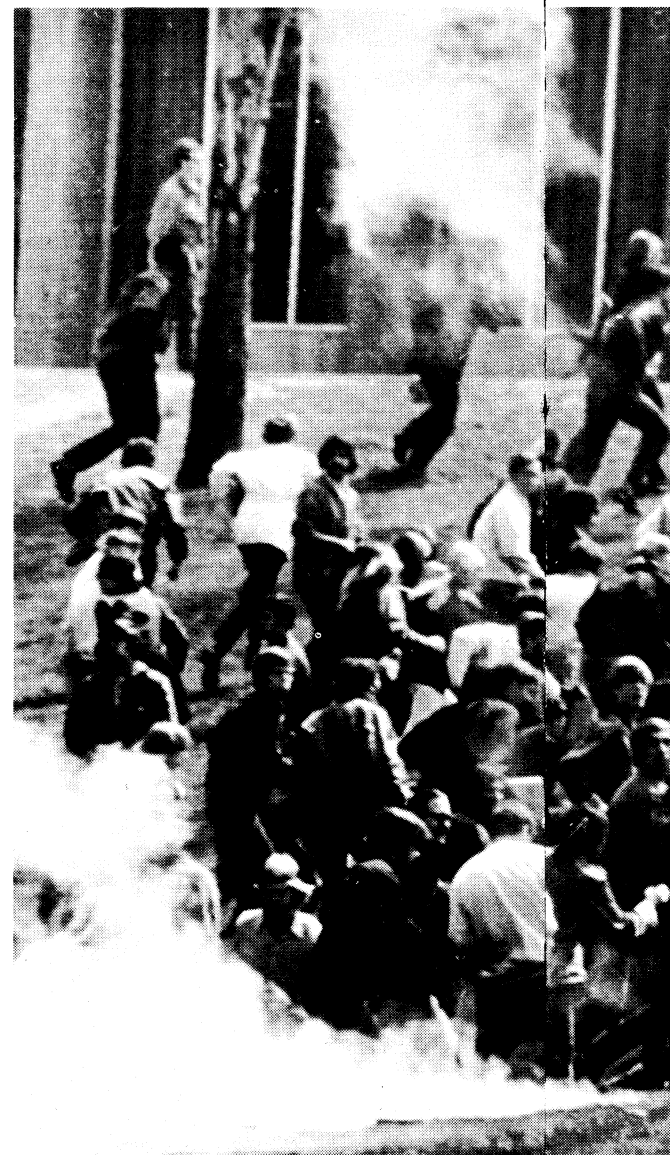
Tear gasperses stu

to strike at Southern Community State College in New Haven, a college with no previous reputation for student activism. Students are protesting the war and the fact that they were locked out of school by the administration last Wednesday in anticipation of the weekend Panther rallies only, as they later discovered, so the campus could be used to house the National Guard.