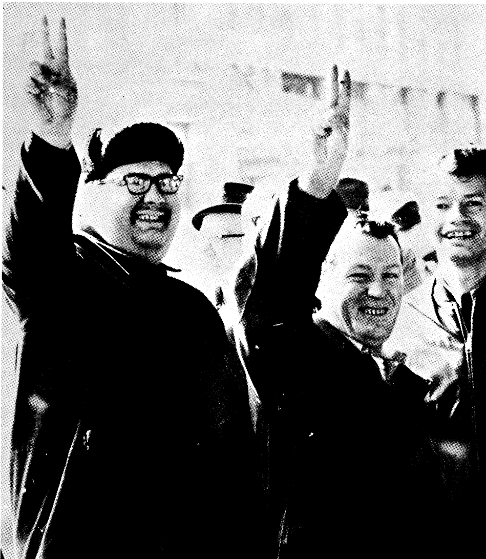
Militancy and solidarity throughout

The candidates of the Socialist Workers Party, now campaigning in all sections of this country, are the only candidates for public office who unconditionally support the striking postal workers and who urge the formation of a labor party based on the trade union movement.