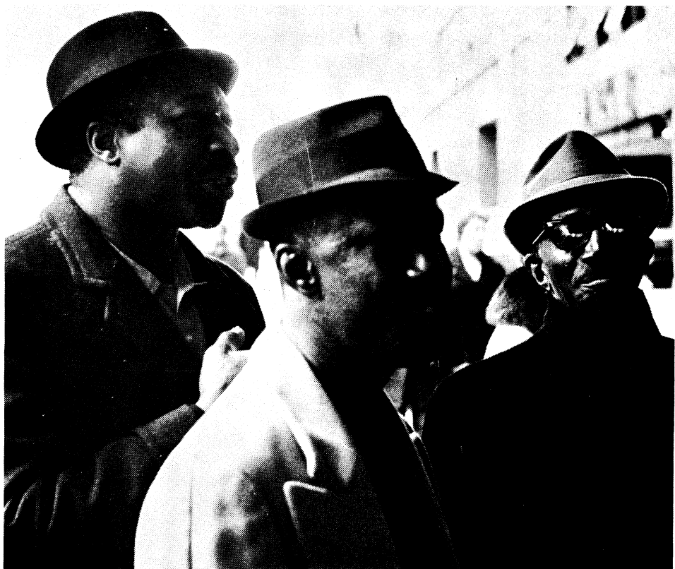
Strikers at New York Post Office