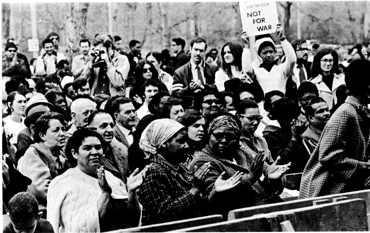
New Yorkers protest slash in social services funds