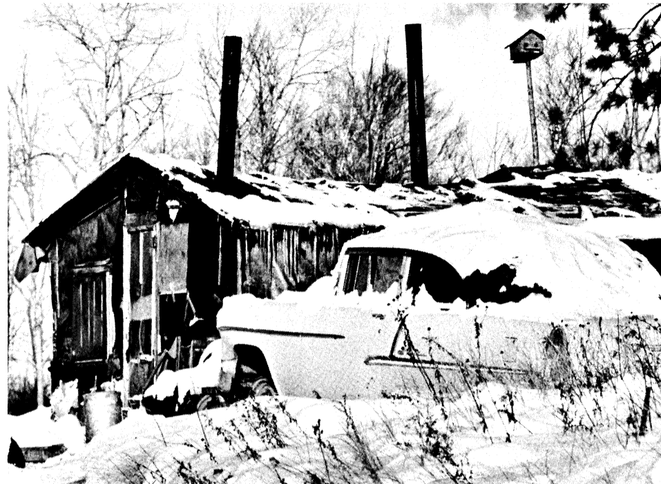
WHY A RED POWER MOVEMENT. Winter on an Indian reservation in northern Minnesota.