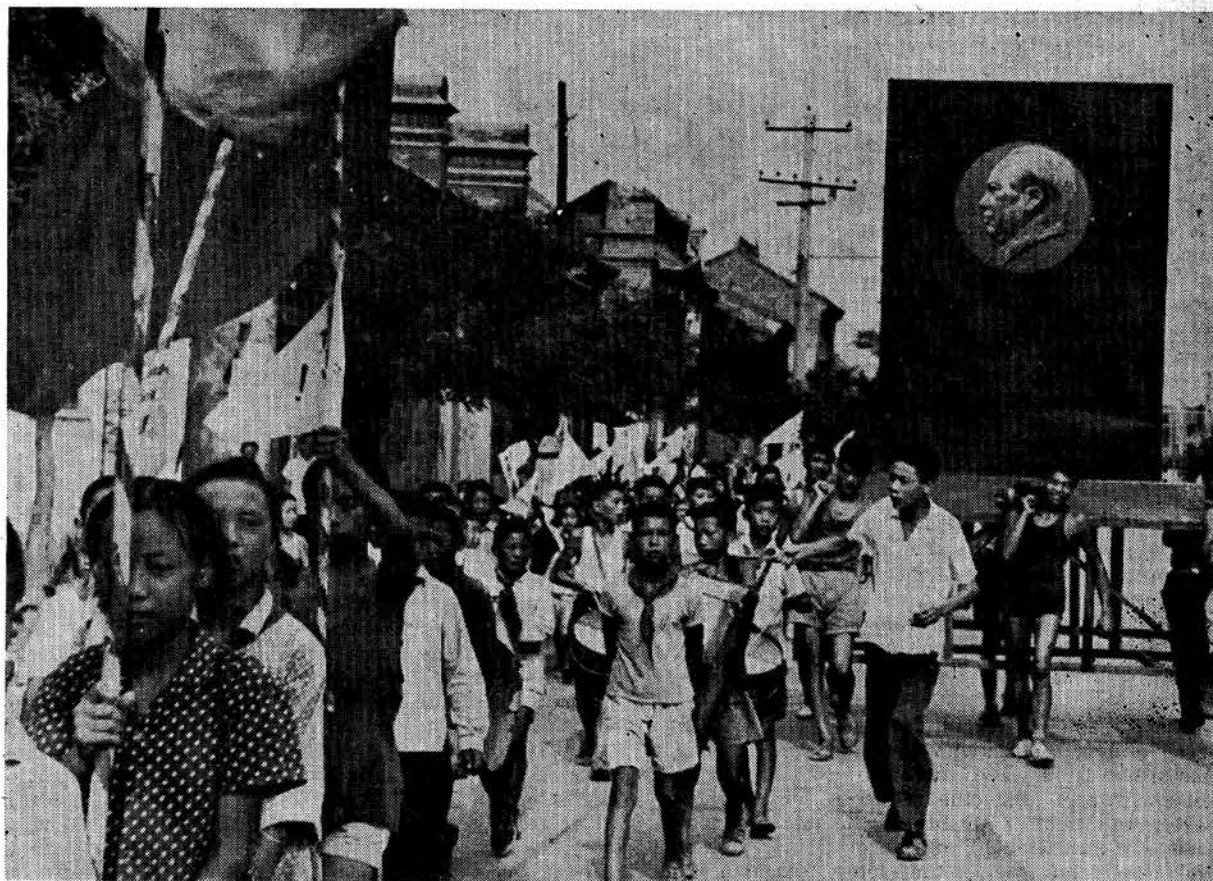
PEKING PARADE, Red Guards march through Peking street, bearing flags and portrait of Mao Tse-tung.

The youth movement is in disarray. The Central Committee of the Young Communist League was disbanded a month ago on the