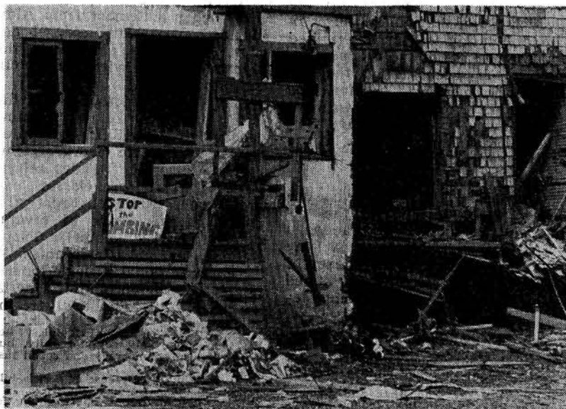
BLASTED. Scene where Berkeley Vietnam Day Committee headquarters was dynamited April 9.

SEATTLE. Socialist Workers Party. LA 2-4325.