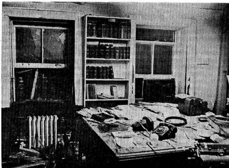
ATTACK ON CP: Scene in editorial office of The Worker after Sept. 4 bombing of Communist Party headquarters.

Some years ago, I read in the Widner library at Harvard a volume which chronicles the sequence