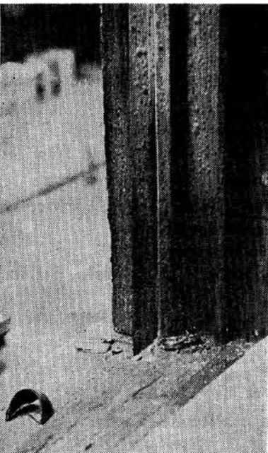
NEAR MISS. Remnant of molotov cocktail on window sill of Militant editorial office. This one failed to do damage.

The news of the fire bombs thrown at the national offices of the Socialist Workers Party came in the midst of our petition campaign to have the Detroit Common Council approve the city's paying burial expenses and medical bills for the three Young Socialists shot on May 16. The parallels between the murder and shooting here in Detroit and the recent fire-bombings in New York are easily seen. In both cases the attack was carried out by reactionary individuals encouraged by the vicious anti-communism launched and maintained by the U.S. government. In both cases, the Socialist Workers Party became a target (along with SNCC, the VDC, the Communist Party, the black ghettos) of the pattern of violence directed against those who oppose racism, the war in Vietnam and other abuses of capitalism. In both cases, the SWP has refused to give up its fight to remove the basic cause of these abuses; capitalism. What happened here on May 16 resulted in a greater determination than ever to work for the creation of a socialist society. We know that the same attitude exists in New York among our comrades. — Detroit branch, Socialist Workers Party.