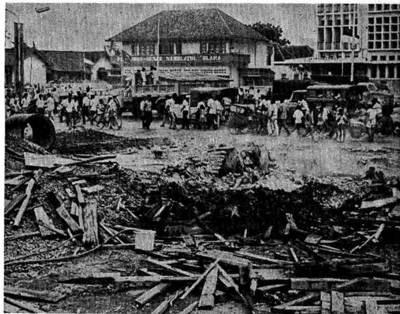
DESTROYED. Ruins of Communist Party headquarters in Jakarta following attack by reactionaries.

which were against Dutch colonialism; namely, nationalist, religious and Communist political thought. Thus it is natural to say that there will be national unity in Indonesia if these three political currents unite within the NASAKOM cooperation." 22