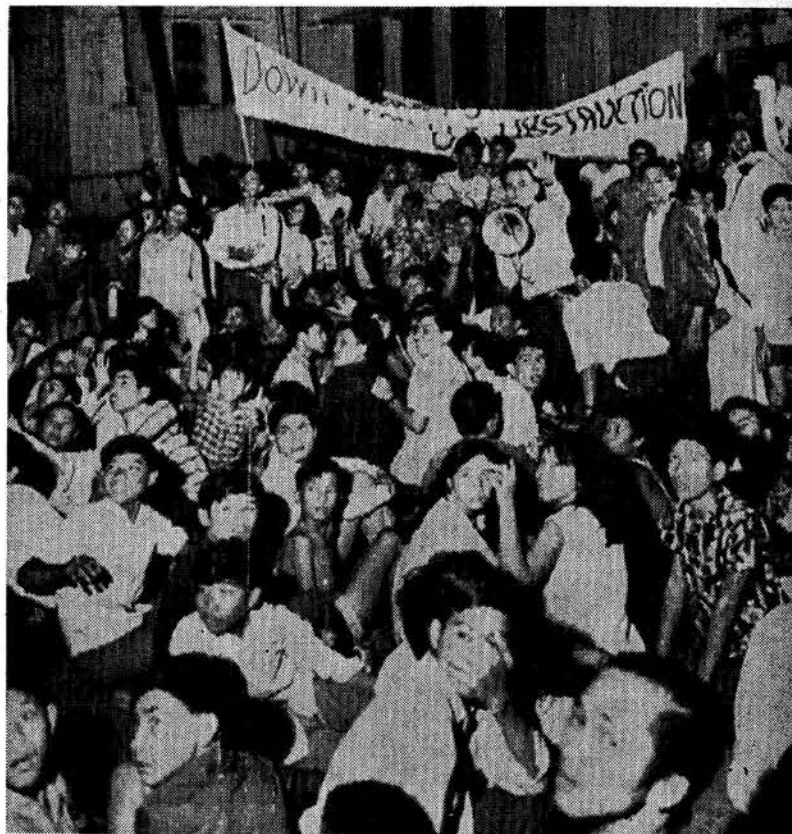
AGAINST KY REGIME. Saigon students during demonstrations last spring against Ky dictatorship.

"The Americans feel the junta should re-establish control over Danang, now in the hands of Buddhist leaders and rebellious army units . . . The occupation of Danang by pro-government troops