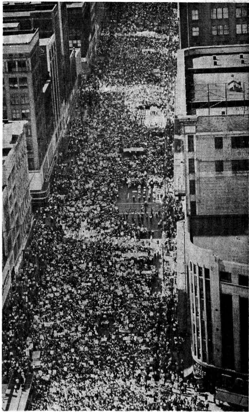
THE POTENTIAL. Part of mass march of more than 200,000 Detroit Negroes who demonstrated against racial discrimination two years ago, shortly after violent outbreak in Birmingham, Ala. The dynamic character of black struggle for freedom has become a central factor in American politics today and can provide motor force for social change.

In addition there is the effect of the colonial revolutions themselves. For one thing, they give inspiration to people in the U.S.