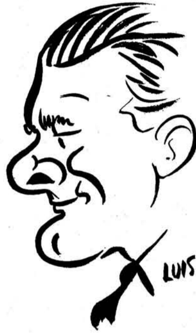
Henry Cabot Lodge

On the question of negotiations, Lippmann verifies in carefully