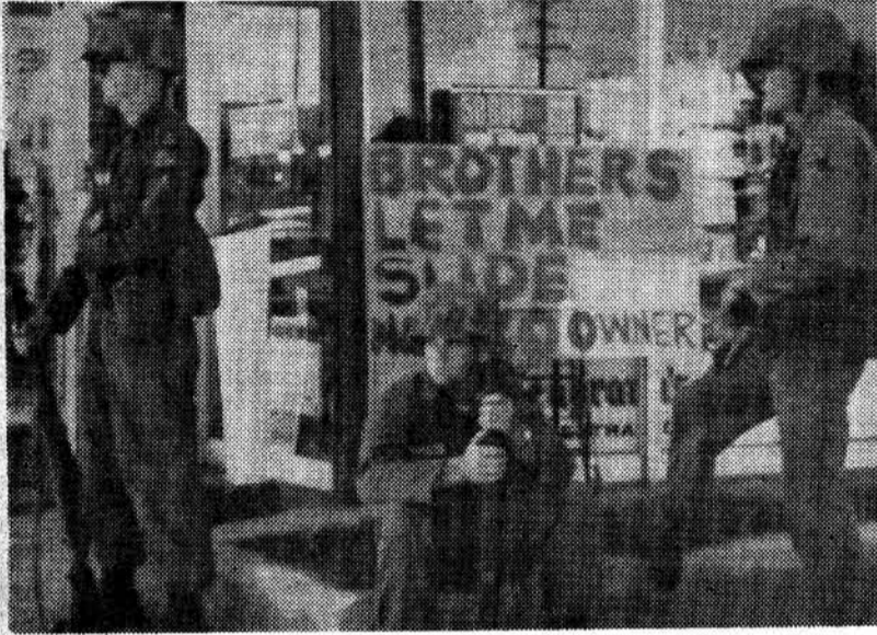
GUARDSMEN. Members of National Guard on duty before store left undisturbed during Watts Uprising. Sign in window says, "Brothers Let Me Slide, Negro Owner."