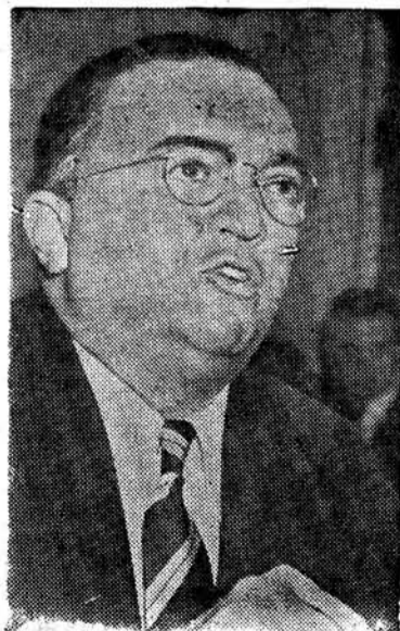
J. Edgar Hoover