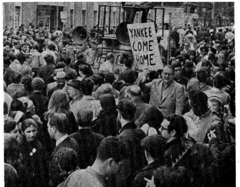
Scene at New York antiwar demonstration

At the Washington Assembly of Unrepresented People held in August, many leaders and activists from these committees gathered in the Vietnam workshop to hash out the question of national coordination. Out of these discussions, a National Coordinating Committee was formed with a steering committee consisting of representatives from over thirty