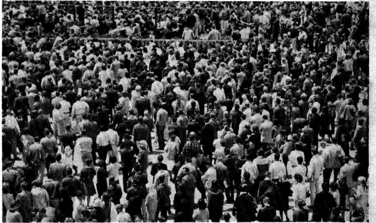
WANT PEACE. Part of crowd of 15,000 that gathered in Berkeley, Calif., to protest against U.S. war in Vietnam.