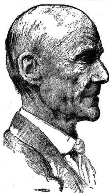
Eugene V. Debs

In China and the Soviet-bloc nations, it will be marked by huge official parades. But many in those parades, while subscribing heartily to the official speeches about defending the economic conquests of the revolution, will see in the holiday a symbol of something unmentioned by the speechmakers.