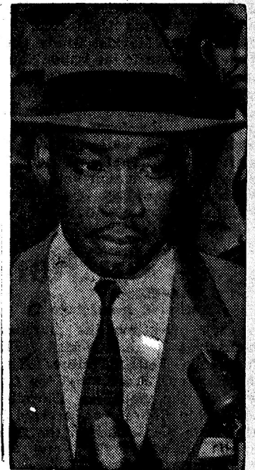
Rev. Martin Luther King

The Negroes are demanding desegregation of the city's parks, hospitals, libraries, buses and jury service and equal employment opportunities. Their organization, the Albany Movement, was first set