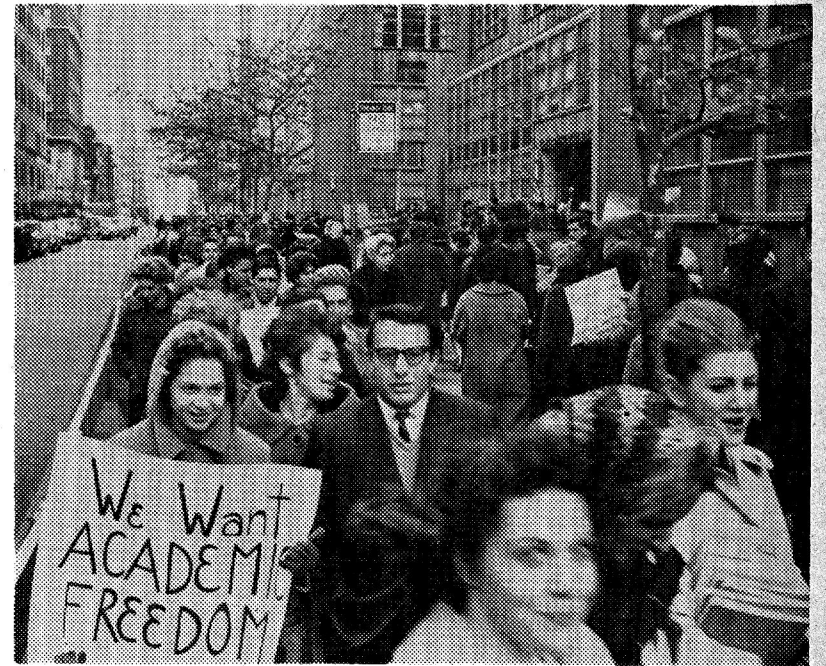
Part of the picket line at the Manhattan campus of Hunter College as students struck for the right to hear all points of view.