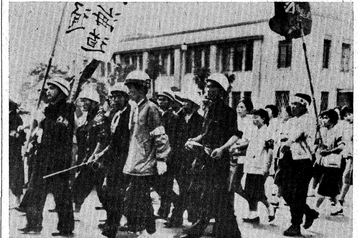
Two days before the general protest strike of five million workers in Japan, a group of unionists are shown demonstrating together with students. Some of them wear helmets in readiness for a police attack as they march towards the Diet building. They shouted slogans against Premier Kishi and the hated U.S. war treaty which was rammed through the Diet under pressure from Washington against the overwhelming opposition of the Japanese people.