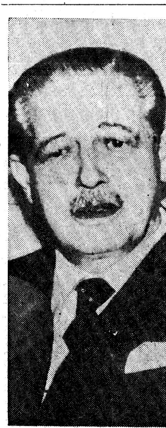
Tory Prime Minister Macmillan rode back into office last fall on the crest of prosperity in Great Britain. Now there are signs that the boom may be petering out.

If it has been possible to realize surplus value on an extended scale again in the past year, what about its extraction? There is no doubt that at that point of production the general situation, aided by the acquiescence of the trade-union hier-