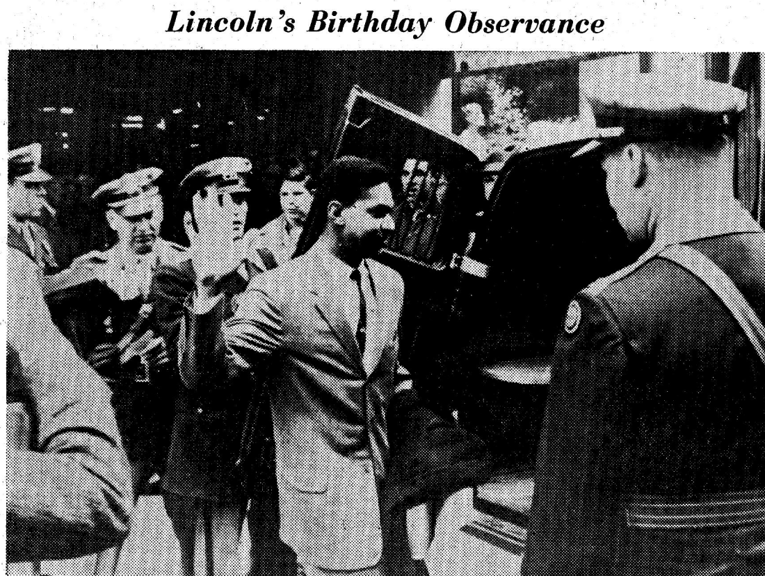
Cops in Richmond, Va., observed birthday of the Great Emancipator by arresting 35 Negro college students. They were charged with "trespassing" by owners of Thalheimer's, city's largest department store, for protesting segregated lunch counters. Undaunted youth waves at photographers as he enters patrol wagon.

In contrast to this somewhat discouraging field report, (Continued on Page 2)