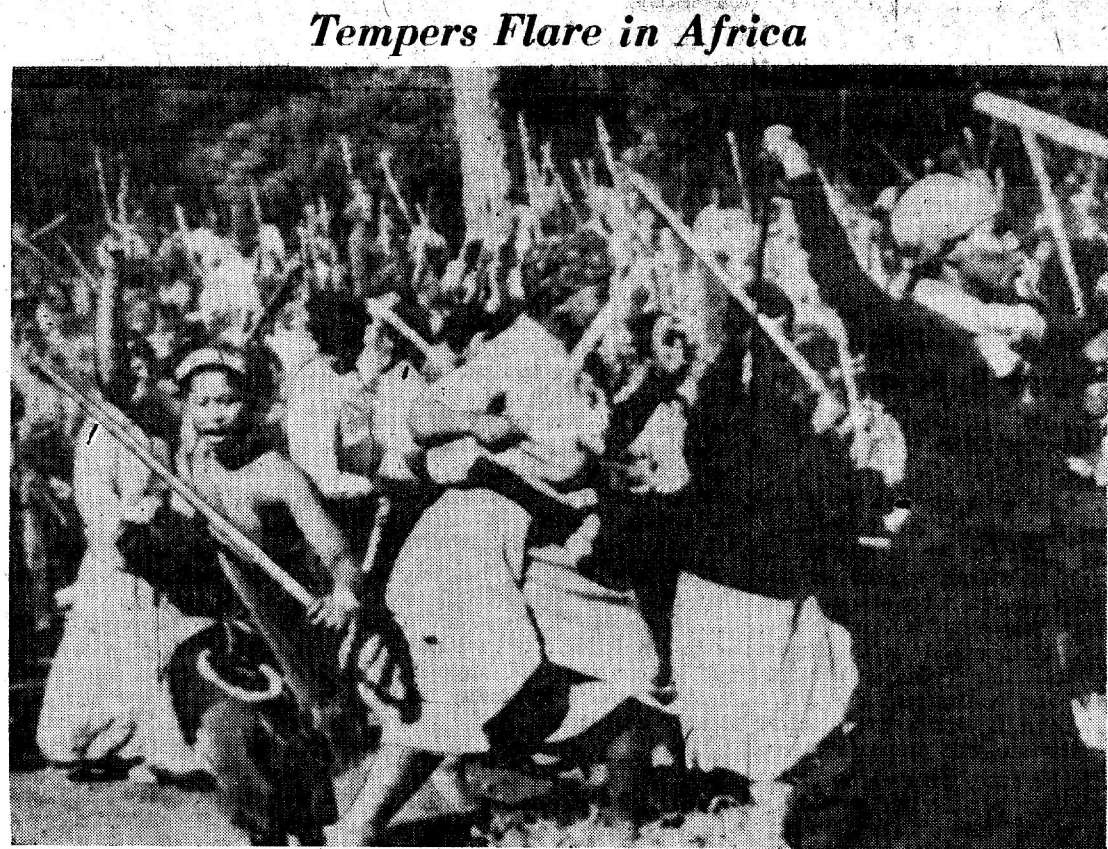
Part of a crowd of 1,500 African women who battled armed police last summer. The women were demonstrating, sticks in hand, against an increase in the poll tax. City officials at Ixopo frowned on the protest and ordered police into action. Increasing civil strife in Africa has moved British Prime Minister Macmillan to advise "apartheid" rulers of South Africa that it would be discreet to modify their brutal exploitive system.

We pledge to do all in our power to aid by protests the halting of injustices in their countries. What is foreign "interference" for the capitalists is international solidarity for the working people.