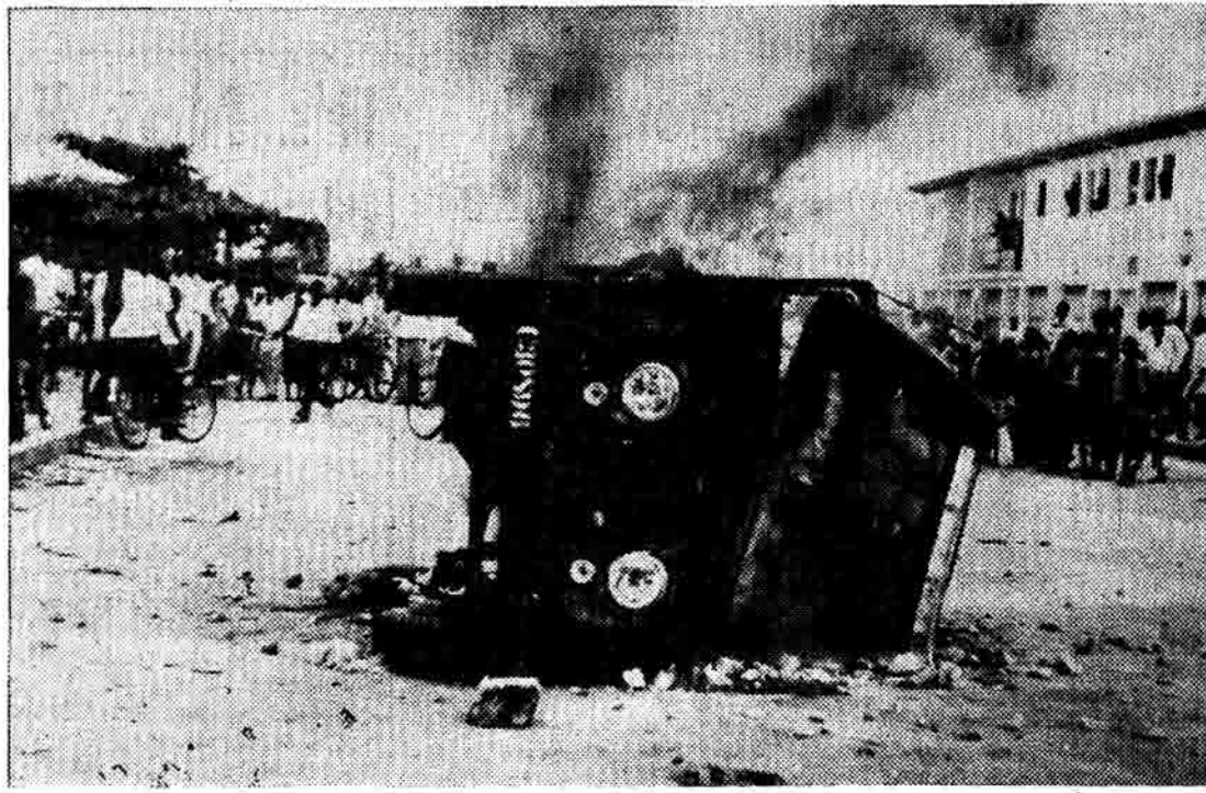
Police jeep was overturned and set on fire during demonstrations in Leopoldville last January in which Congolese demanded an end to Belgian rule. During the demonstrations police and paratroopers killed 89 Negroes and wounded 100 others. When the Congolese achieved independence eleven weeks ago, they expected to be rid of all imperialist interference in their country. Instead, the Congo has become the scene of a free-for-all scramble for advantage by contending imperialist forces behind UN intervention. (See story page 1.)