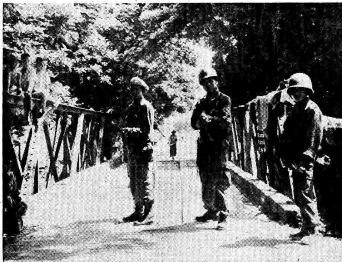
Rebels belonging to the second paratroop battalion, guard one approach to the Laotian capital of Vientiane following their predawn coup on Aug. 9. The troops, headed by Captain Kong Le, overthrew the U.S.-supported regime and promoted the establishment of a new neutralist government under Premier Phouma. A counter-rebellion against the newly formed Phouma government, inspired by the extremely reactionary Defense Minister Gen. Nosovan, is reported in progress in Southern Laos. A U.S. carrier force has been sent to patrol the South China seas near Laos.