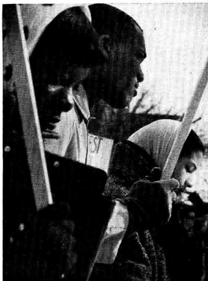
Negro and white students join in demonstration at Madison, Wisconsin to show solidarity for anti-Jim-Crow movement in the South. "This issue appears to have aroused" the present campus generation "as have few others," said the New York Times, March 20, in its front-page roundup of student picketing in the North.

Negroes were attacked by a gang of 100 whites after police had forced them to end a three-day lunch-bar sitdown. The cops didn't interfere with the whites.