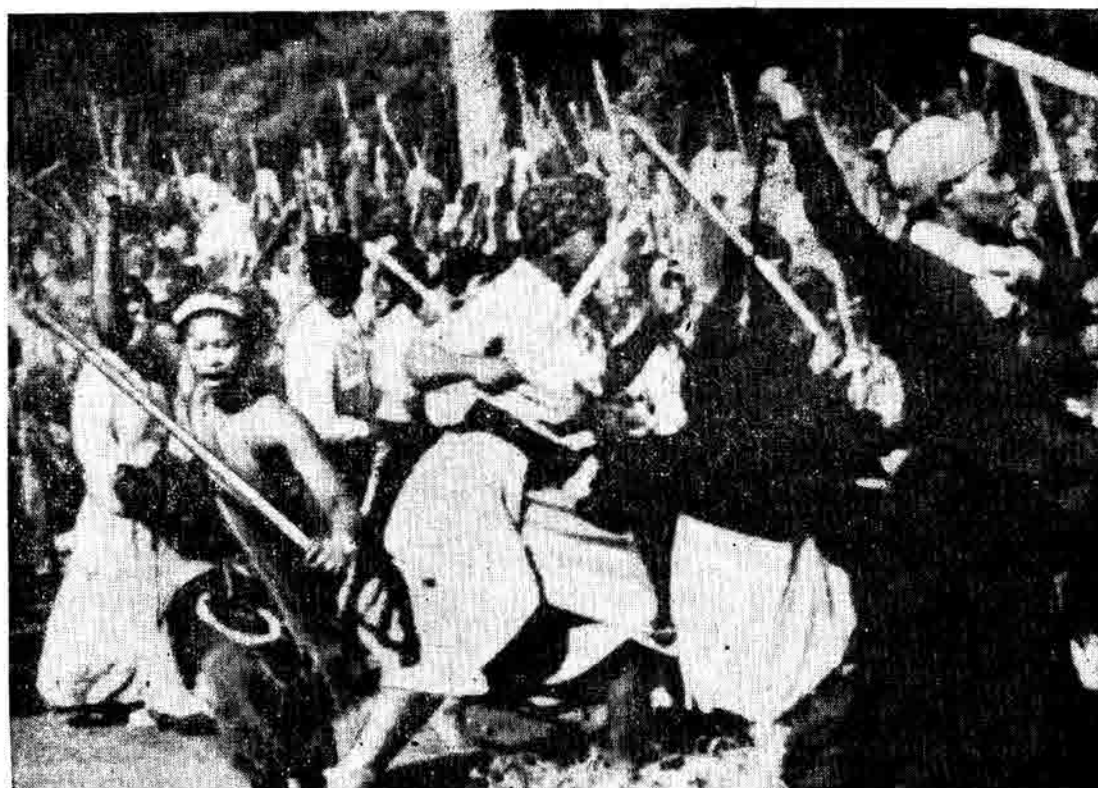
South African women are sparking a campaign of militant opposition to racist oppression. These are part of the 1,500 women who fought back with sticks against armed police attacking their demonstration in Ixopo Aug. 20. The women demonstrated against a new increase in the poll tax.