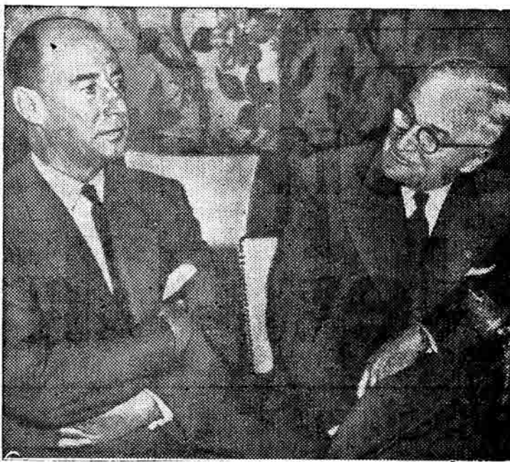
Adlai Stevenson (left) and ex-President Harry Truman meet the press. An undeclared contender for the 1960 Democratic presidential nomination, Stevenson has largely confined recent political utterances to the need for convincing the people of the world that it is the U.S. and not the Soviet Union that seeks peace. Yet Stevenson is a member of the Democratic Party's National Advisory Council which has consistently raked the administration's giant arm program as "inadequate."

into a direct rejection of an open bid for power by monopoly capital."