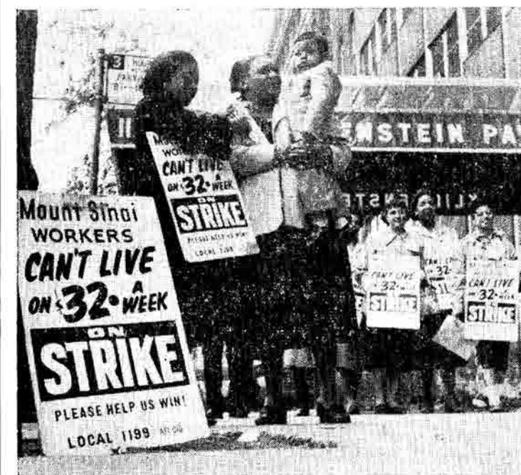
Picketline scene at New York's Mt. Sinai Hospital during 46-day strike that won partial union recognition at voluntary hospitals. The strike inspired similar hospital organizing drives in other cities. Now two hospitals in Chicago are on strike. (See story this page.)