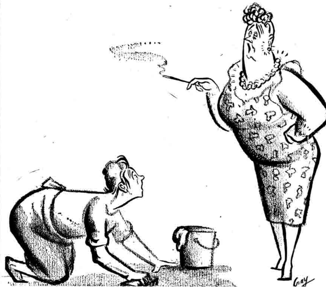
"You know the new anti-union law makes featherbedding illegal, so we'll have to reconsider your Thursday afternoons off."

The shooting in Laos is thus one of the end products of State Department intrigues.