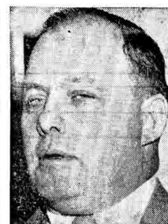
AFL-CIO president George Meany: Labor "is quite definitely in a bad fix"; but we have not, "reached the point of a third party."

Senate and House conferees will now meet for one week to iron out differences between the bills passed by the respective houses. Nothing good will come out of it for labor. As AFL-CIO president Meany declared Aug. 18, labor is "quite definitely