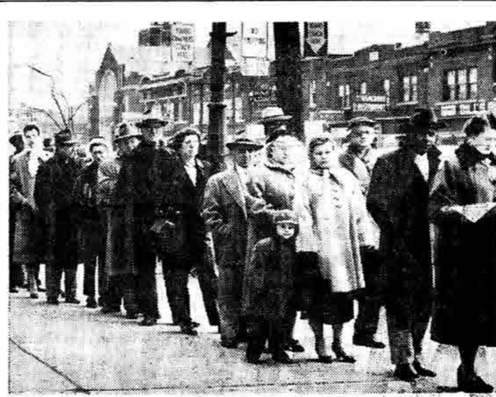
Detroit auto workers lined up at an unemployment compensation office during peak of 1957-58 recession.

Thus after the 1905 Russian Revolution was defeated, all Marxist tendencies were discussing the premises for a new upturn in the revolutionary mass movement. The question of the effect of the economic situation in Russia on these