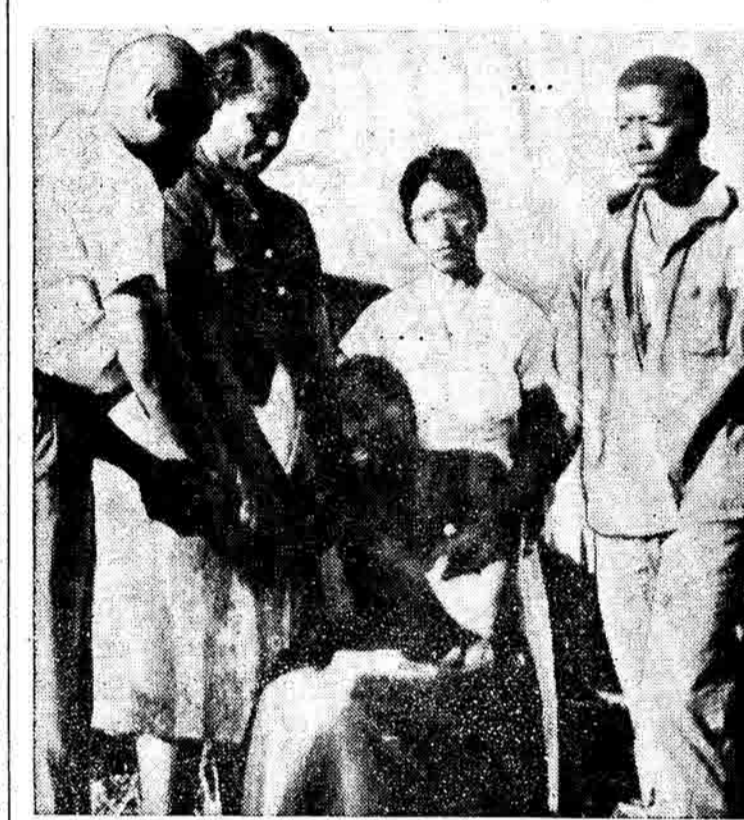
Bereaved friends of Mississippi lynch victim Charles Mack Parker at his funeral May 5. The FBI investigated for weeks and compiled a list of the killers who dragged Parker from a prison cell. But they "mercifully" turned the names of the lynchers over to racist Governor Coleman who said he wouldn't be able to do anything about it until next November.