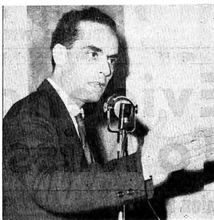
Mahjoub ben Seddik, General Secretary of Union Marocain du Travail, addressing the second National Congress of the organization. He declared that the ultimate aim of the Moroccan trade-union movement is "To end the exploitation of man by man." Mahjoub was imprisoned and tortured during the struggle for independence from French imperialism.