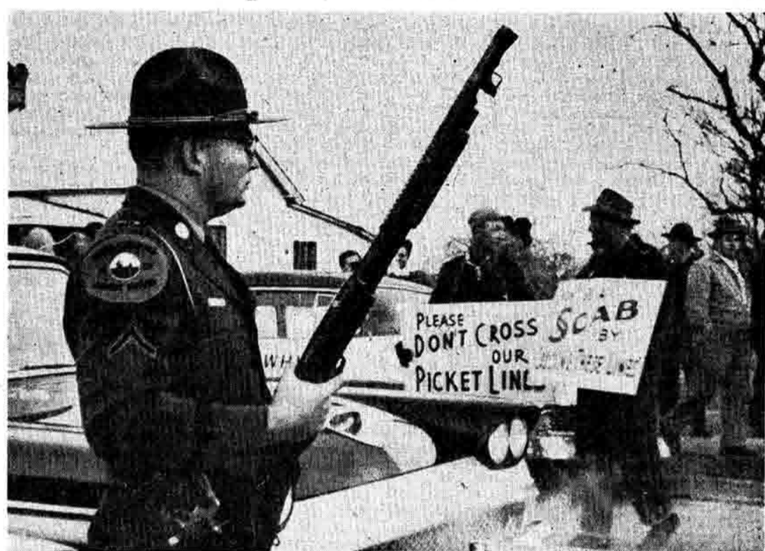
State police enforces court order that pickets at Henderson, N. C., cotton mill must stay 75 feet away from entrance. The companies' "back-to-work" drive got no response from among 1,000 United Textile Workers' members. So bosses hired scabs. Strike is now in its 26th week. AFL-CIO union is appealing rest of labor for aid.