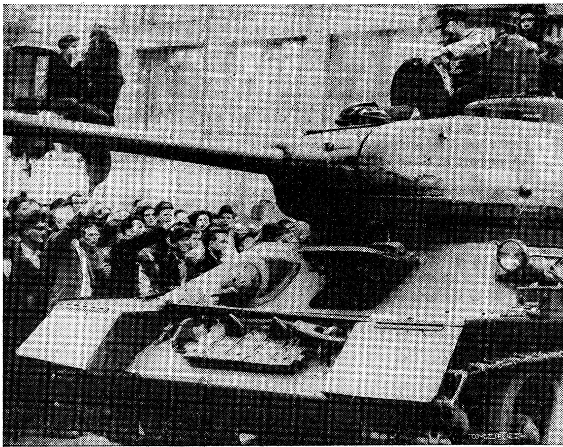
Pictured above is a Soviet tank used against East Berlin workers in the June 1953 East German general strike. Tanks were also used against workers in the Poznan demonstration this June. The Polish government now admits it was an authentic workers demonstration over legitimate grievances.