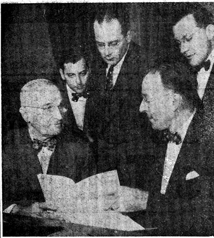
President Truman meets with his "fact-finding" board after deciding to order government attorneys to get a Taft-Hartley injunction against the nation's miners. But so far injunctions have produced no coal.