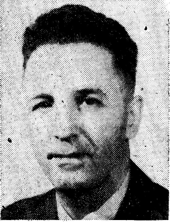
FARRELL DOBBS Socialist Workers Party candidate for Governor of N. Y.